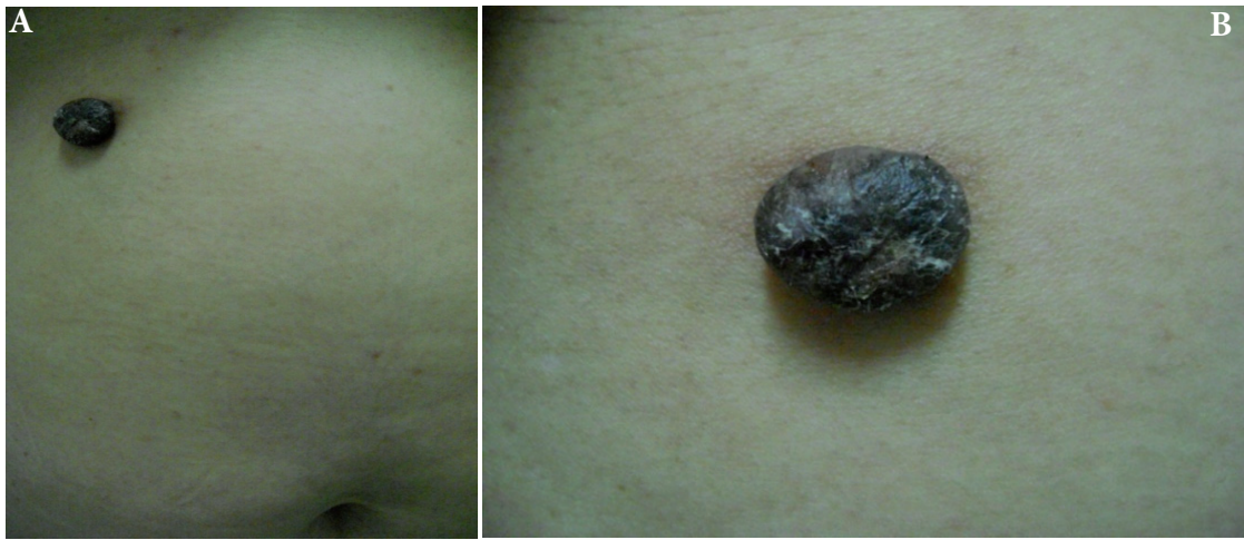
Figure 1: A and B. Hyperpigmented, hyperkeratotic nodule on abdominal skin. lesion appear to be 0.5 mm long x 0.3mm wide in size

barricade, with pigmented areas and few dilated ducts, which are in contact with the resection margins, compatible with eccrine poroma (Fig. 2). Immunohistochemistry was also performed, highlighting Carcinoembryonic Antigen (CEA) with elongated cells that line the cavities that support glandular differentiation. S100 staining was observed in the dendritic cells and melanocytes in the thickness of the cell proliferation (Fig. 2).