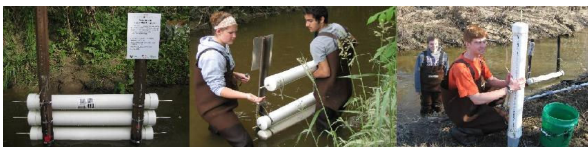
FIGURE 3. Sediment sampling tubes (left) and students harvesting collected sediment (middle) and transferring the sediment quantitatively to a collection bucket (right).

11 common elemental signatures that can be used as part of a larger analysis to fingerprint the origins of the sediment. By combining the elemental analyses with microscopic size and shape analysis of the sediment, reflected light color analysis, radioisotopic analysis and trace biological analysis of pollen and diatoms, it may be possible to uniquely define sources of collected sediment to very precise locations. This environmental forensic geology method is still under development, but shows a lot of potential promise.