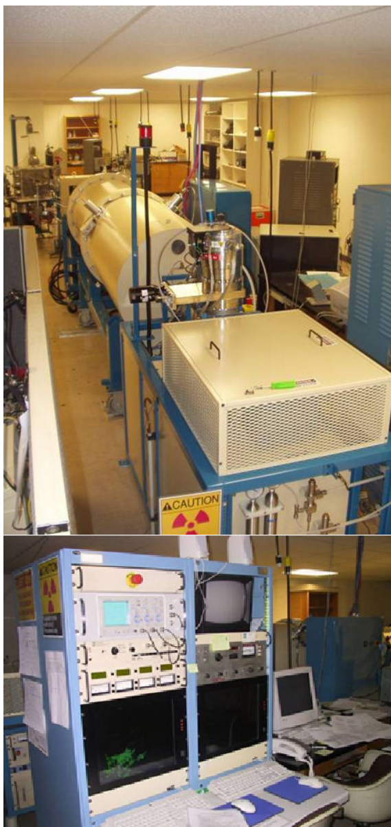
FIGURE 1. The Hope College Ion Beam Analysis Laboratory (tandem pelletron and alphasource ion source on above, control and data acquisition stations on below).