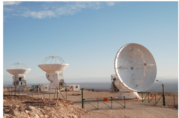
Fig. 4. A Mitsubishi antenna undergoing holographic surface measurements.

will eventually be located in the ALMA offices in Santiago and data will be transferred through a high-speed network.