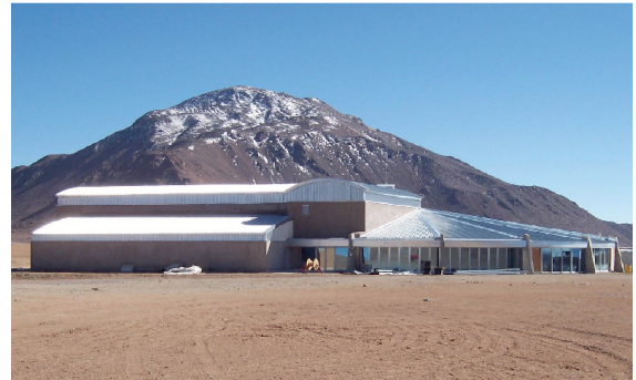
Fig. 3. The ALMA Technical Building on Chajnantor.

The antennas are connected to the correlators through a complex optical fiber network, transmitting digitized astronomical signals. The two correlators are located in the Technical Building on Chajnantor (Figure 3). Array operations and archiving of the data from the correlators will take place in the Operations Support Facility (OSF) situated approximately 30 km away at an altitude of 2800 m. Instrument and major antenna maintenance will also take place in the OSF. The ALMA central archive