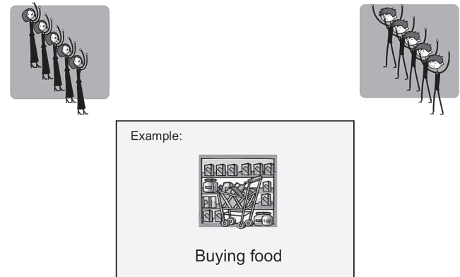
Figure 1. Sample Item from the GRT

With the 26 items validated in the first study, a new instrument was elaborated. The Gender Roles Test-26 (GRT-26) is a computerized task that can be completed online. To complete this instrument, each participant had to press either the right or the left arrow on the keyboard, depending on whether they thought that a male or a female would better perform the activity proposed by the item (see Figure 1 and Table 2). Before completing the GRT-26, the participants completed a familiarization task, which required