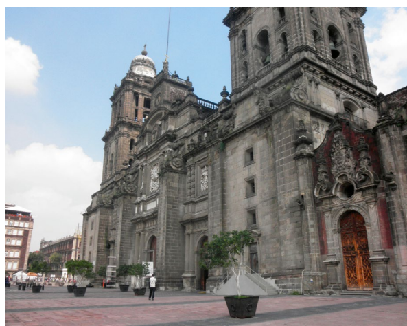
Figure 1. Mexico City's Metropolitan Cathedral

As occurs in other nations, the Catholic Church in Mexico has always required the work of visionary creative artists to communicate to believers, through contemporary art, that there is a continuity between the historic Church and that of today. Through contemporary art, believers may experience what it means to believe and relate to the divine, and to construct thus their religious experience. This is not only true for Mexican believers; travelers may also enjoy space inside churches and the aesthetic experience of religious art (Huidobro, 2014).