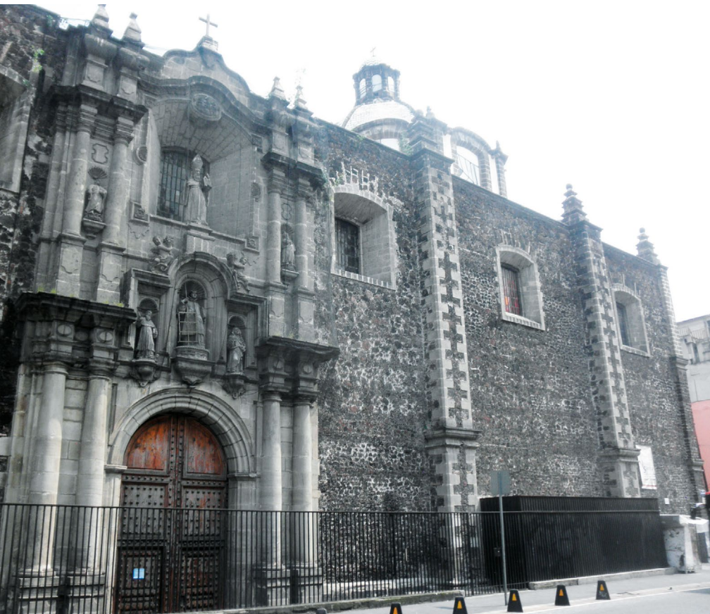
Figure 2. Parish of San Lorenzo Mártir, where Mathias Goeritz contributed his artwork before taking charge of the stained glass windows of Mexico City's Metropolitan Cathedral