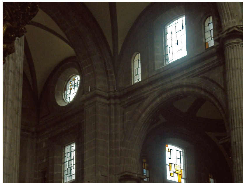
Figure 8. Interior of the Metropolitan Cathedral of Mexico City, showing the current view of the stained glass windows designed by Mathias Goeritz

September 1967 was set as the deadline for the complete removal of the stained glass windows. Nevertheless, in January 1967, a disastrous fire destroyed part of Goeritz’s work, along with important older works, such as the choir benches, that would take years to be restored (Figure 7). In light of this disaster, specialists discussed the future of the Cathedral, and two positions were suggested: that of “neobarroque restorers” against the stained glass windows, and that of “modernists and renovators” in favor of preserving the windows.