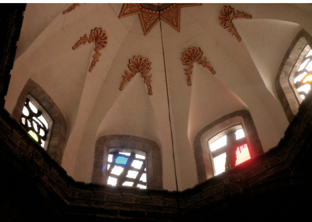
Figure 4. View of the dome in the San Lorenzo Church in Mexico City, containing what many consider to be the most interesting stained glass windows of Moorish influence in Mexico