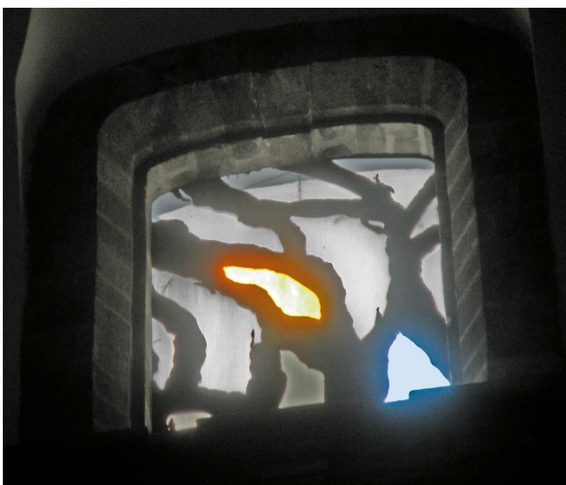
Figure 10. One of Goeritz's stained glass windows in the dome of Mexico City's San Lorenzo Church