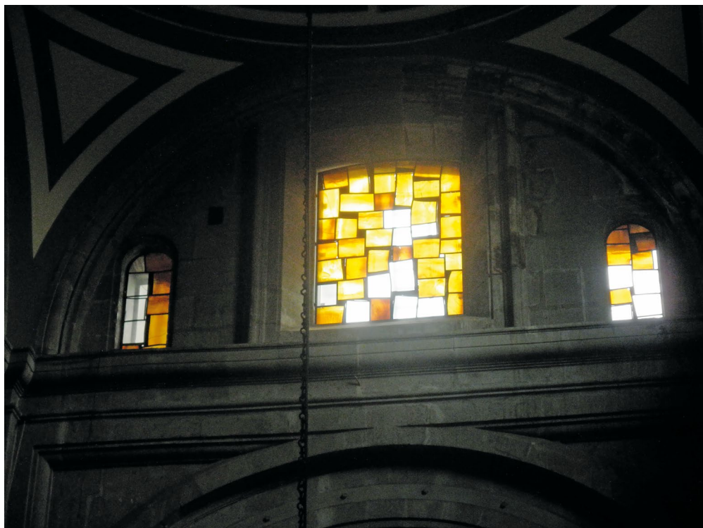
Figure 6. Detail of one of the stained glass windows of the Metropolitan Cathedral of Mexico City