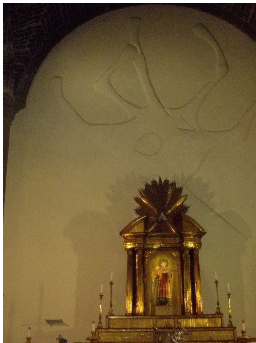
Figure 3. Cement relief in the wall behind the altar in Mexico City's San Lorenzo Church