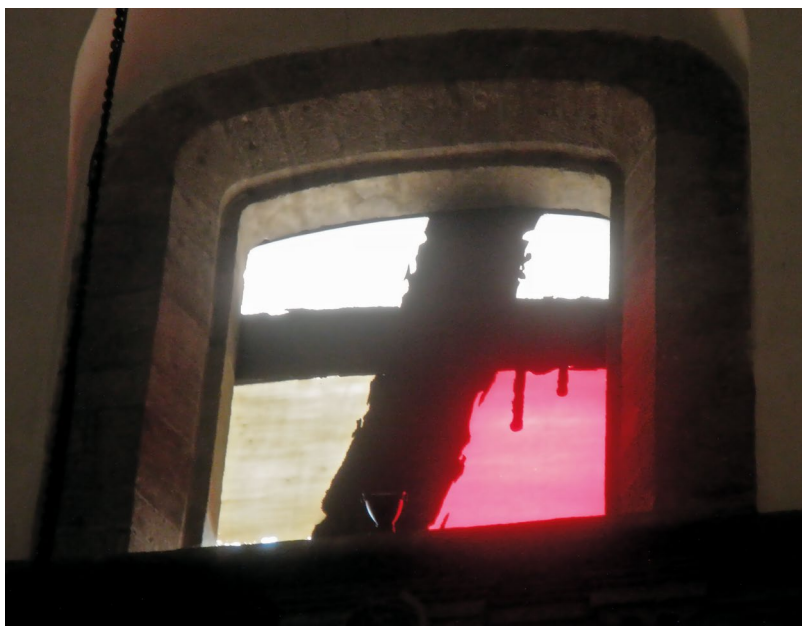
Figure 9. Detail of one of Goeritz's stained glass windows in Mexico City's San Lorenzo Church