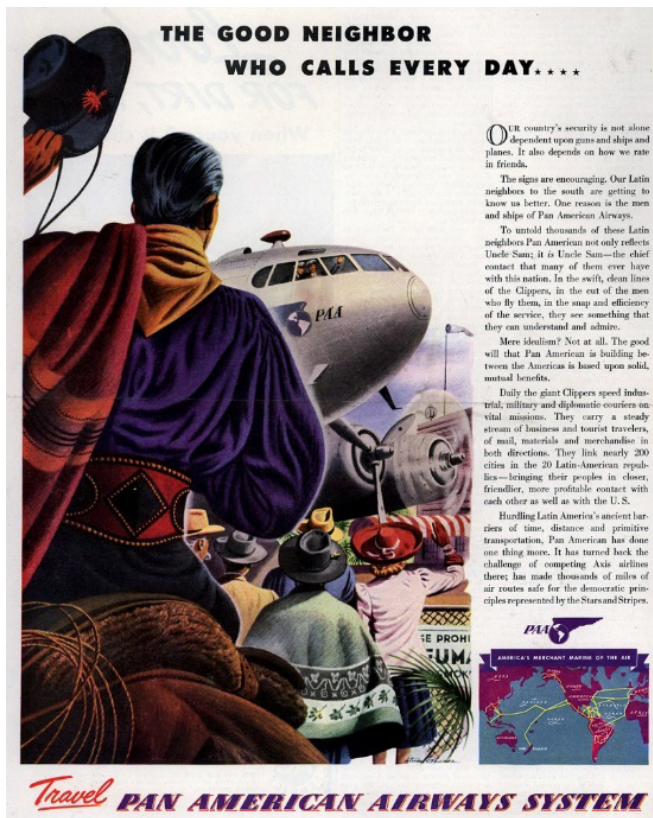
Figure 3. The Latin Neighbors in PAA's Grand Narrative