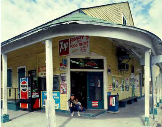
The store is located _____ corner.

on between under in front of over with in on top of toward