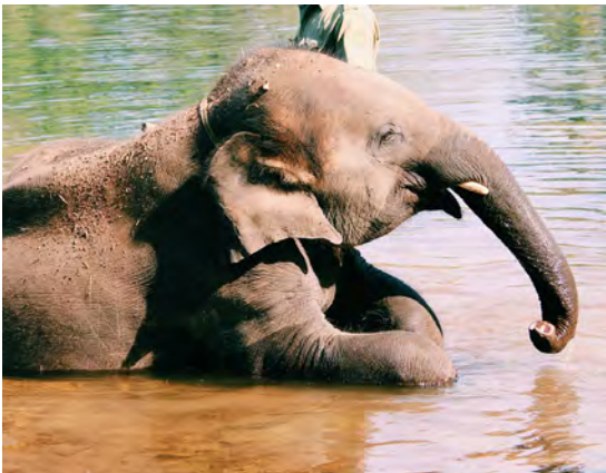
The elephant is sitting _____ the water.