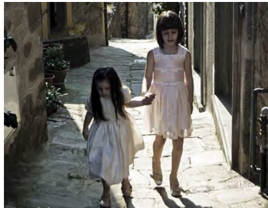
The girls are _____ two buildings.

teaching students through workshops as well as platforms, taking into account set learning outcomes, instructional goals, availability of time and resources,