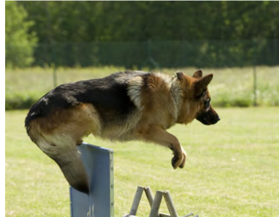
The dog is jumping _____ the fence.