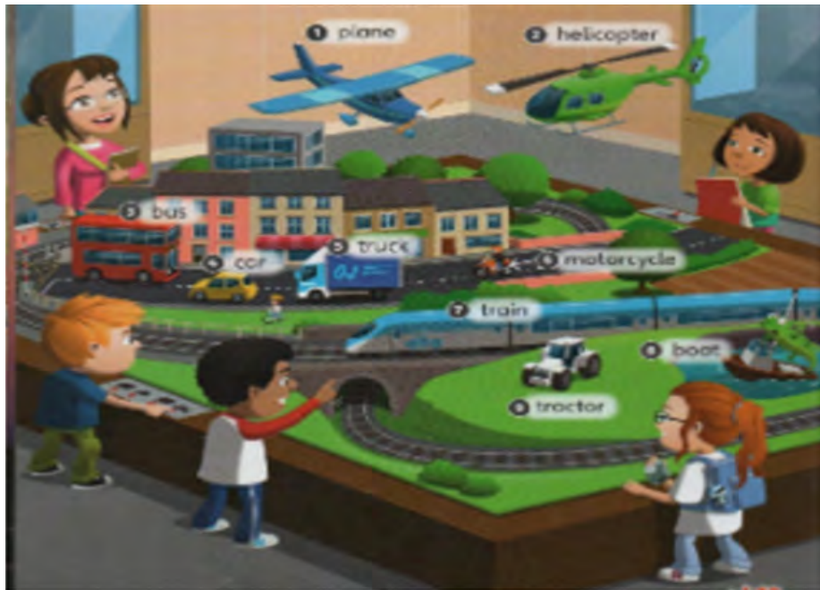
Figure 3. Picture of Lorena's Task

There are 9 means of transportation in the image. Do you recognize them? Try to guess the means of transportation in the image by the following descriptions ( intenta adivinar los medios de transporte por su descripción ).