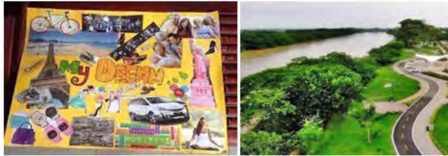
Figure 1. Milena's and Miguel's Posters

or asynchronously, depending on each participant's teaching context.