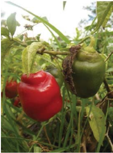
Figure 1. The intense red color in rocoto pepper fruits. Evidence of physiological maturation stage.

To guaranteed seed extraction, longitudinal cuts were made on fruits using surgical masks and latex gloves (Pacheco & Zuñiga, 2007). Seed disinfection was performed by seed washing with hypochlorite water solution at concentration of 5% v/v, followed by two washes with deionized water. Subsequently, seeds were dried at room temperature for one day.