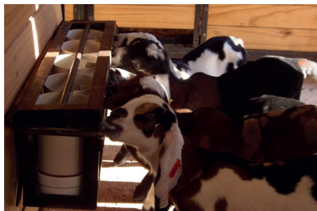
Figure 2. Milk replacer supply system (bucket with teat).

with nursing bottles and later on, with individual buckets equipped with a plastic probe connected to a nipple for goat kids (Figure 2). Nipples were placed in an upper position to allow the passage of the milk replacer by suction and not by gravity, to reduce losses due to dripping.