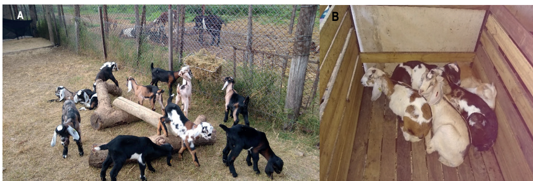
Figure 1. Daytime outdoor pen (A) and night indoor boxes (B).

Daily, the boxes were cleaned and disinfected with quaternary ammonium, and the wood shaving was changed. The outdoor pens were regularly sprinkled with lime to prevent diseases.