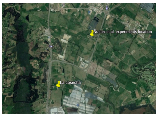
FIGURE 1. Detailed location of the experiments from Nústez et al. (2009) and the weather station that was used as data source.

Atmosphere: Meteorological data for the second half of 2004 was obtained from the Instituto de Meteorología,