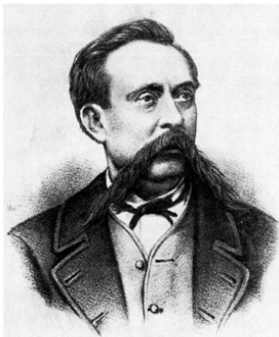
FIG. 1 Nikolai Nikolaevich Zinin (1812-1880) (“Academician N. Zinin,” 1860/1870)

Zinin's memory was devoted session of the German Chemists Society, which took place in Berlin on March 8, 1880. August Wilhelm von Hofmann informed participants about Zinin's death. Hofmann is his short speech did not list his entire scientific achievements, reminded one epoch-making discovery – transformation of “nitro compounds into anilines”. He said also that he met Zinin personally in Giessen in Liebig's laboratory in the end of the XIX century thirties. He emphasized Zinin's modesty and “excitation with which he moved towards the science”. Finally, Hofmann said: “Even if Zinin did not does nothing more except nitrobenzene reduction to aniline, his name would be written with letters of gold in the history of chemistry (Hofmann & Tiemann, 1880, p. 440; Borodin & Butlerov, 1880, cited by Zinin, 1982, p. 209).