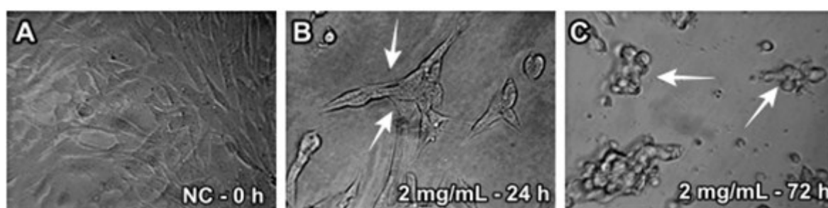
Figure 3. Cytotoxic effect of Sphagneticola trilobata extract ( 2.0 \text{ mg mL}^{-1} ) on morphology of 3T3 cells comparing: (A) Negative Control - 0 h; (B) acute exposure (24 hours); (C) chronic exposure (72 hours) exposure. The arrows indicate morphological alterations and cell death.

Qualitative evaluation performed through microscopic observation after 24, 48, and 72 hours of exposure showed dose-dependent morphological alterations in all concentrations of S. trilobata extract. The evaluation revealed retraction, cellular detachment, rounding of cell border, and intercellular spaces increase as shown in Figure 3.