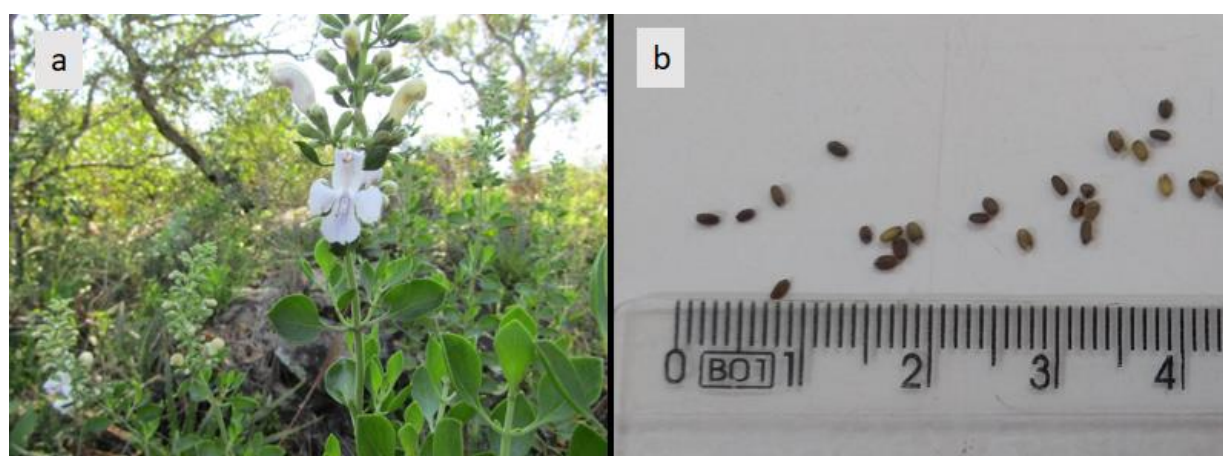
Figure 1. Adult plant (a) and seeds (b) of Hesperozygis ringens .

Hesperozygis ringens (Benth.) Epling, popularly known as espanta-pulga , is a native shrub that belongs to the Lamiaceae (Figure 1a). It can be propagated from seeds (Figure 1b) or cuttings, of which the latter results in high rates of rooting, even with cuttings collected from populations in situ (Siqueira et al., 2020). The species is found in fields with rocky, sandy soils in Rio Grande do Sul, where it is restricted to Serra do Sudeste and the southern Missões region, in Alegrete, Caçapava do Sul, São Francisco de Assis and Santa Maria (Fracaro & Echeverrigaray, 2006; Freitas, Trevisan, Schneider, & Boldrini, 2010; Schaefer & Essi, 2017).