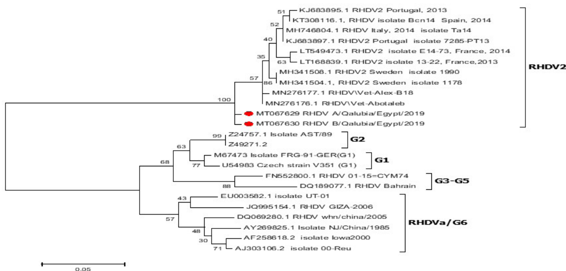
Fig. 2. Phylogenetic tree of RHDV based on partial nucleotide sequences of the VP60 gene. The isolates from this study are indicated by red circles.

Mean HI antibody titer increased gradually until reach its peak at fourth WPV (9.1 and 9.5 log 2 for 1 st and 2 nd groups respectively). These results revealed that the oil adjuvanted vaccine elicited an earlier and higher humoral immunity than aluminum hydroxide gel adjuvanted vaccine. There were significant differences at first and second WPV ( p <0.05) but no significant differences at third and fourth WPV. The RHDV antibody titers of rabbits that survived at fourth WPV were monitored, starting from first to second weeks post challenge. HI test