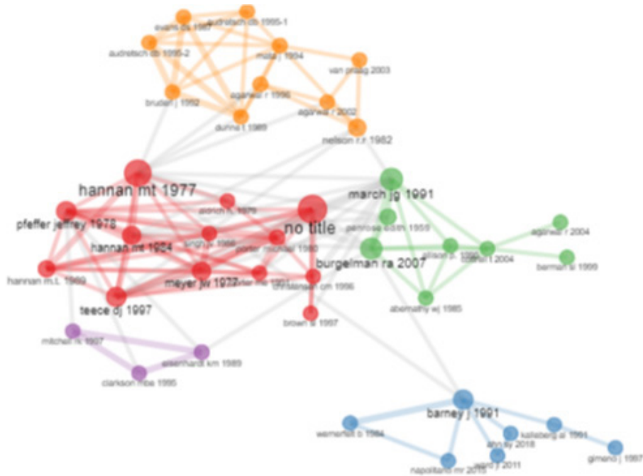
Figure 2. Network of document citations -WOS