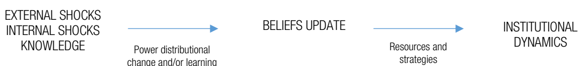
FIGURE 3 EXPLANATORY FACTORS OF INSTITUTIONAL DYNAMICS

Based on the previous discussion, Figure 3 presents a proposal to review the set of possible relationships between knowledge, learning and change evidenced by the ACF (Figure 1).