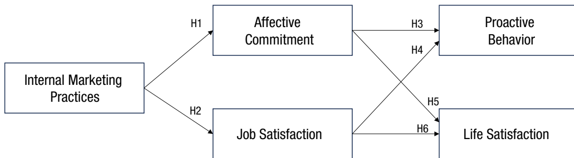
FIGURE 1 CONCEPTUAL MODEL