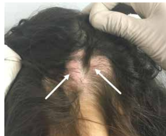
FIGURE 2: Soft, smooth, some ulcerated tumors, 1 to 3 cm, surrounded by an area of alopecia on the scalp