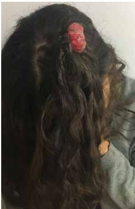
FIGURE 1: Exophytic, ulcerated, 10x5 cm tumor with sanguinolent exudation on the left parietal region

Trichilemmal cysts correspond to 20% of cutaneous cysts, the others classified as epidermoid cysts originating from trichilemmal or external root sheath of the hair follicle. 1,11 PTT seems to originate from these lesions, presumably after inflammation or trauma, due to the fact that have areas with benign characteristics and others with malignant properties. 1,5-12 It differs from the trichilemmal cyst because it is uncommon, larger, and histologically more atypical, and the malignant proliferative trichilemmal tumor is less aggressive. 9 PTT occurs more frequently in women (79,5-87% of cases)