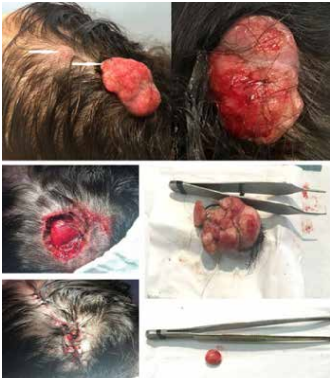
FIGURA 3: Extensive excision of two proliferating trichilemmal tumors on the scalp