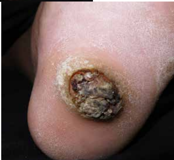
FIGURE 2: Approximate image of the left plantar lesion