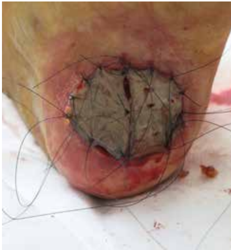
FIGURE 6: Immediate post surgery with abdominal graft

The patient evolved with good graft healing and subsequent return to daily activities. After 1.5 years of follow-up, we observed no lesion recurrence.