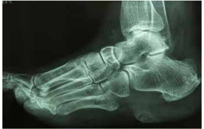
FIGURE 3: X-ray of the left foot Nodular image with radiotransparent halo in soft tissues in the plantar region

A biopsy was performed based on the suggested hypotheses of VC, keratoacanthoma, common wart, and amelanotic melanoma. The result favored the diagnosis of VC. Excisional