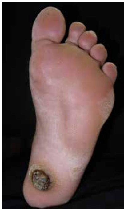
FIGURE 1: Exophytic lesion with verrucous surface, with infiltrated and ulcerated border in the left plantar region