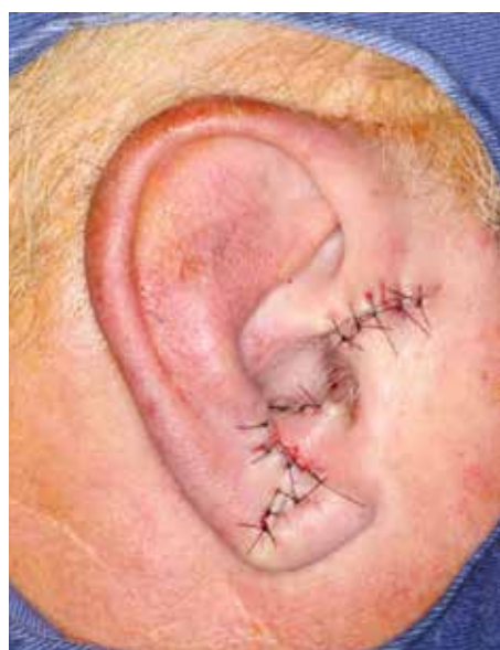
FIGURE 3: Surgical defect of 1.5 cm x 1.4 cm, affecting the total thickness of the antitragus. Design of the earlobe transposition flap