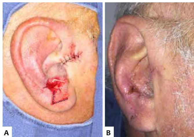
FIGURE 2: A. Transpositional flap with closure by primary intent of the secondary defect. B. Ten days postoperative