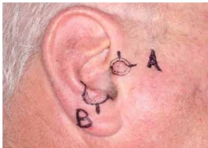
FIGURE 1: Nodules infiltrated in the region of tragus and antitragus, with previous histological diagnosis of well-differentiated infiltrative SCC