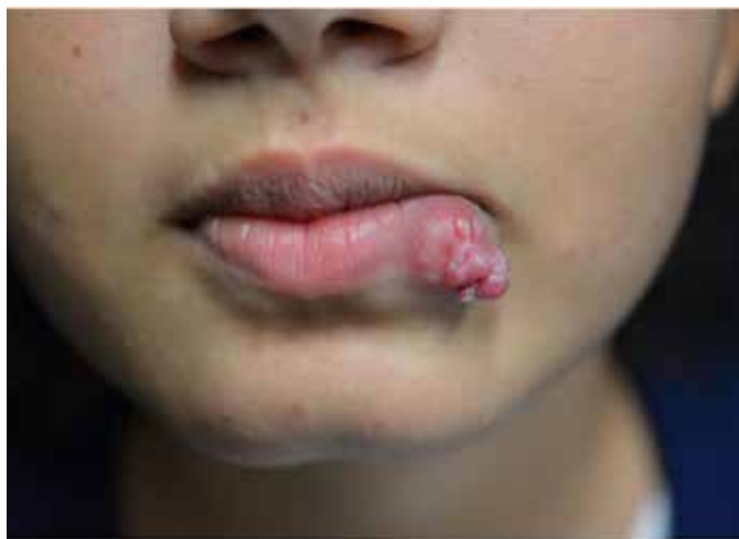
FIGURE 1: Nodosidade eritemato-violácea, de superfície mamilonada e consistência fibroelástica

The desmoid tumor or desmoid fibromatosis consists of fibroblastic proliferation, originating in the soft tissues, with benign behavior. McFarlane first described it in 1832, and Muller coined the term desmoid five years later, based on the myofibroblastic cells that constitute these tumors. It has an estimated frequency of 3% of all soft tissue tumors. It most commonly affects individuals between 15 and 60 years old, being rare in the pediatric age group and after the fourth decade, with a slight preference for women. Its most frequent form of presentation is intra-abdominal, accounting for about 70% of cases. 6,7,8