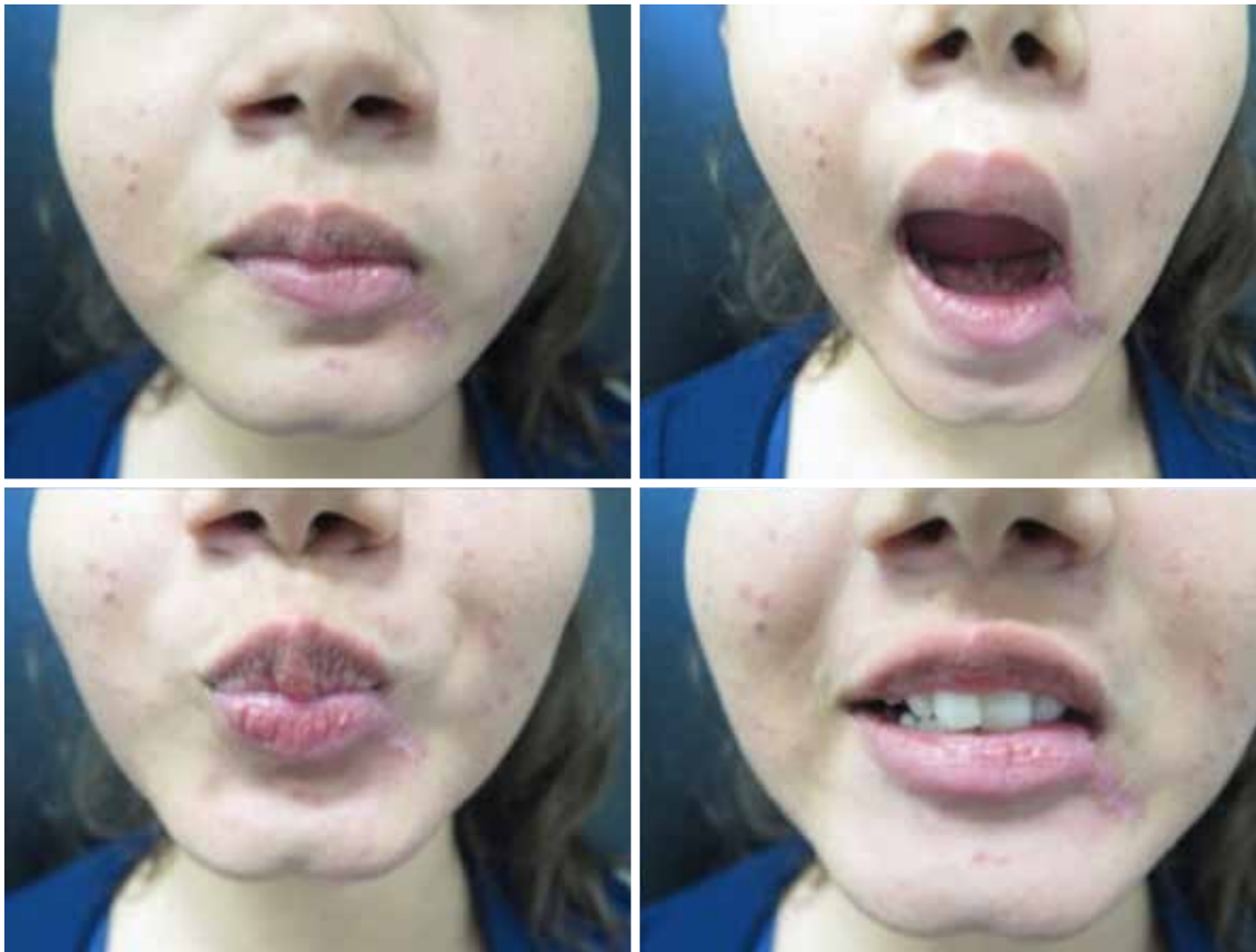
FIGURE 4: Paciente avaliada após 1 ano do procedimento com bom resultado funcional

structures. The majority is asymptomatic; however, due to its significant regional growth, it can compress or compromise other structures, organs, or the functionality of the affected region. 13,14