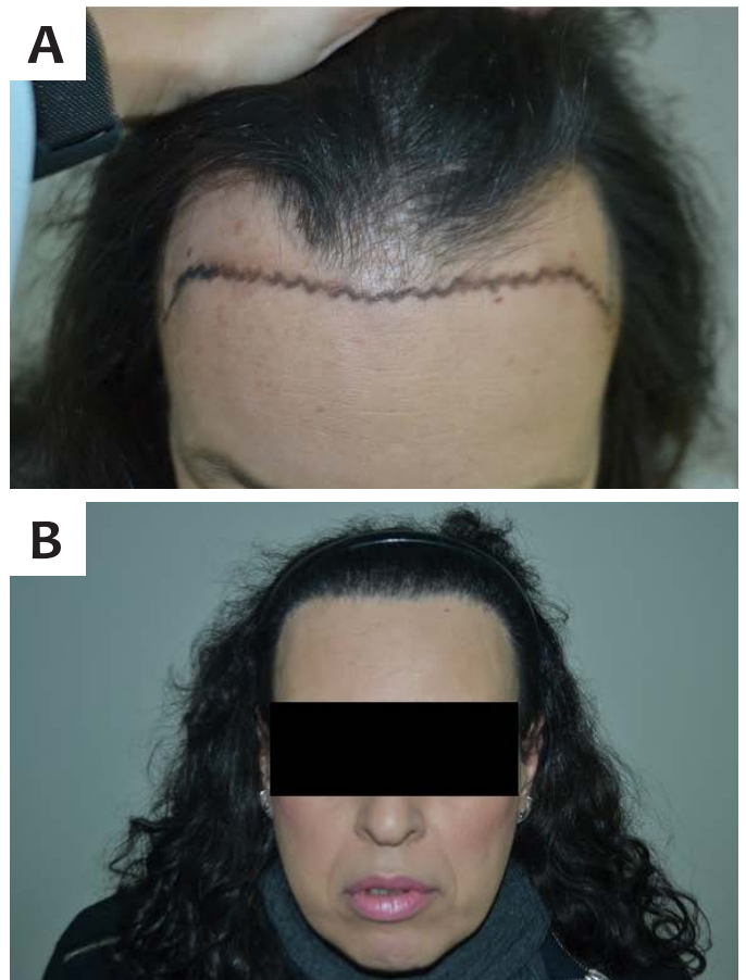
FIGURE 2: A - Before transplantation; B - Final result after one year of hair transplant