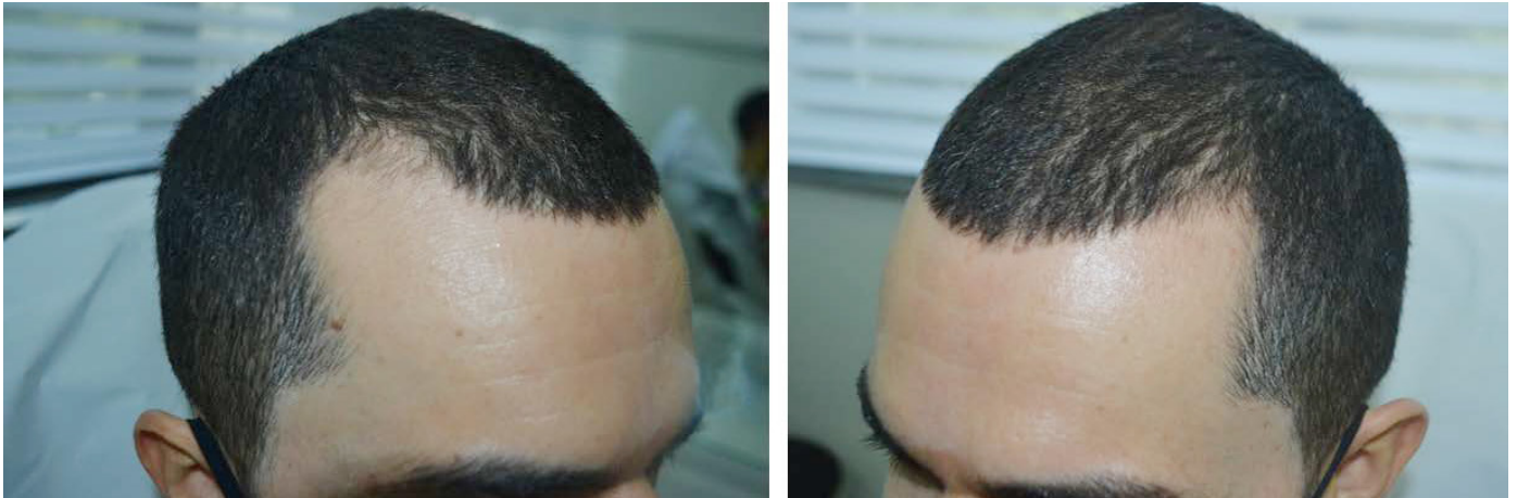
FIGURE 3: Before hair transplant