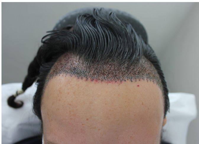
FIGURE 1: First day after hair transplantation using the Follicular Unit Transplantation (FUT) technique

A 37-year-old transgender woman with androgenetic alopecia, who already used dutasteride 0.5 mg and minoxidil lotion for seven months and had no intention of gender-affirming hormonal therapy, sought our Service. She presented an excellent donor area with follicular units with three hairs, good density, and a distance from the recess to the mid-pupillary line of 6.5 cm (Figure 3). We performed hair transplantation using the Follicular Unit Extraction (FUE) technique in the bitemporal region, maintaining the previous line. The design was 5 cm of bitemporal recess x 8.5 cm of anterior line x 8.5 cm from the glabella to the anterior line, and 1,750 follicular units were used, totaling 3,764 hairs (Figure 4). Follow-up took place on the first postoperative day, 15 days, three months, and six months after surgery (Figure 5) with excellent results.