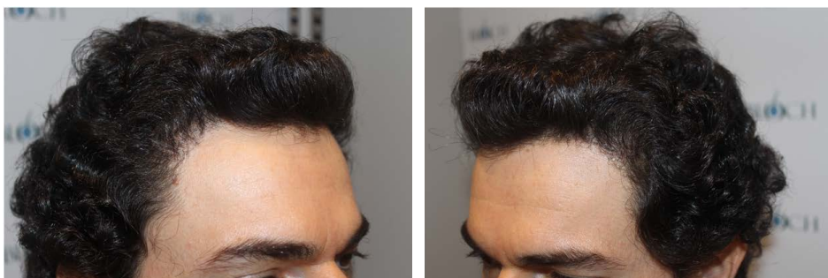
FIGURE 5: Result after six months of hair transplant