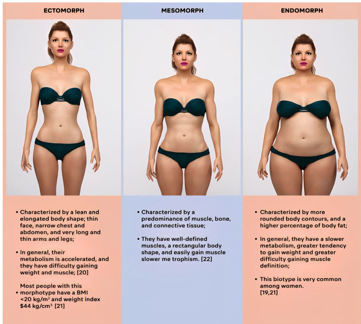
FIGURE 1: Definition of somatotypes according to distribution of bone, muscle, and fat structures

greater the amount of subcutaneous adipose tissue. We suggest a 4-grade classification system according to the amount of adipose tissue present in the treatment area (Table 2).