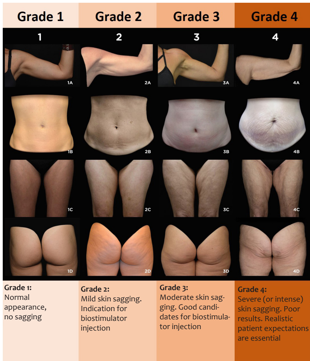
FIGURE 2: Visual grading of skin sagging

ments based on four key factors (Figure 4). Although each of the classic somatotypes has distinctive characteristics, this classification may be considered on a spectrum. 21 Most patients have a predominance of two components, which can make it difficult to determine somatotype. Therefore, it is recommended to consider both visual evaluation and anthropometry/adipometry to define somatotype. It is important to emphasize that we are not suggesting that any one somatotype has a greater or lesser response to poly-L-lactic acid treatment, but rather that body constitution may influence the appearance of the skin and body contour, leading to a more or less apparent aesthetic result. Further studies are required to better understand these aspects