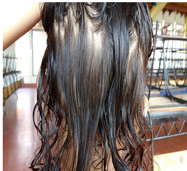
Figure 2. Multiple nits (eggs) on hair.