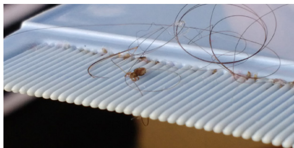
Figure 3. Louse and nits in lice comb.