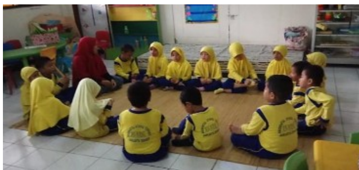
Figure 2. Teaching and Learning Activities in RA. An-Nahl, Jakarta

Closer: At the end of the day, flow is a closing activity; mission activities are also included in closer activities. The teacher carries out activities according to the SOP for returning students. Students who have been picked up may go home at 11.00 WIBB.