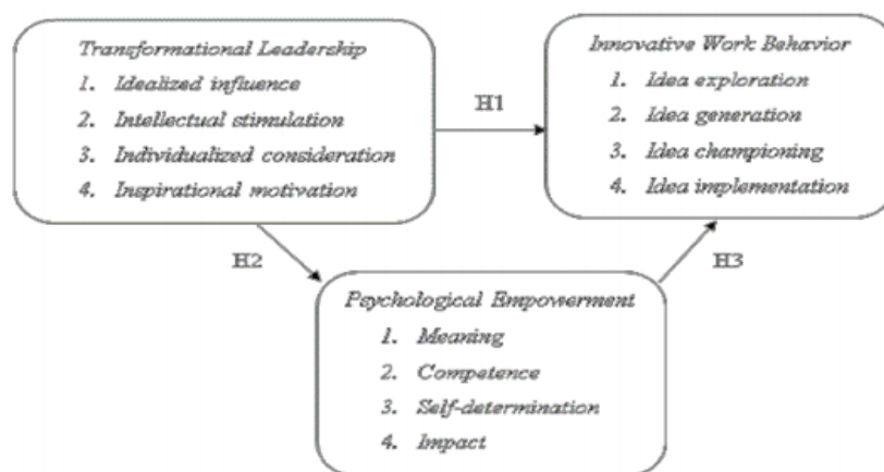
Figure 1 shows the conceptual framework for this research that explains the relationship among variables.

This research used quantitative research. Quantitative research is a scientific research that uses systematic methods and emphasizes a measure of performance. This research focuses on measurement and statistics because they are the links between empirical observations and mathematical expressions of relations. The focus of quantitative research is to develop and test hypotheses and theories that explain behavior. The period needed to conduct this research can be said to be relatively short, and the results also have a high level of generalization. Although conducted in a short time, quantitative research can cover extensive data. Therefore, this type of quantitative research is often used by researchers (Hoy & Adams: 2016; Flick: 2015).