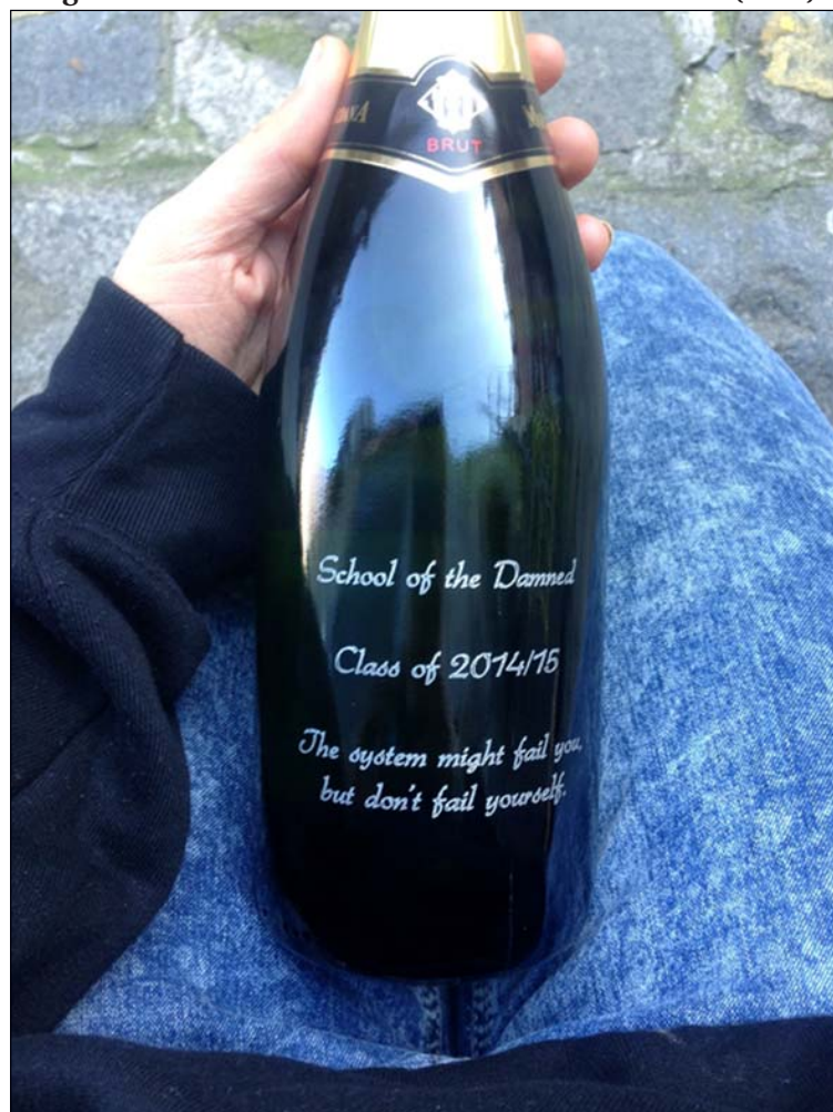
Figure 4 – School of the Damned Graduation Cava (2014)

into homo-oeconomicus (Brown, 2015). Whilst more work needs to be done to align these emergent radical models with the epistemologies of the South, hopefully the act of mapping their polyphonic voices within this paper begins the process of forming the critical alliance between defenders of the pursuit of knowledge without market value' and the 'defenders of postabyssal science' which Santos recognises as the precondition of the pluriversity (Santos 2018, p. 278).