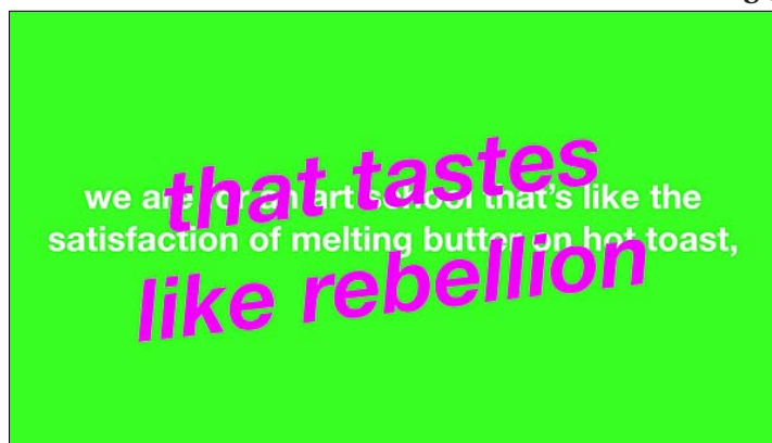
Figure 2 – Video still from the Toma Manifesto-In-The-Making (2018)