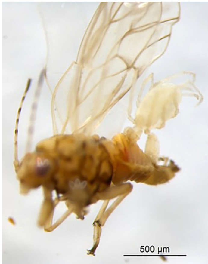
Fig. 1. Larva of Erythraeus sp firmly attached to the abdomen of Russelliana adunca (color mite after their conservation in 70% ethanol).

The psyllid was preserved in ethanol 70% and one of its forewings was mounted in Canada balsam for the identification using a stereomicroscope Leica S8APO and a microscope Trinocular Biotraza XSZ146AT. The studied material was deposited in the collection of the División Entomología of the Museo de La Plata (MLP), Buenos Aires, Argentina.