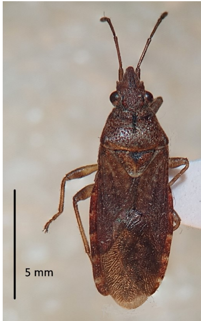
Fig. 1. Orsillus depressus female.

Our specimens show variability on rostral length, ranging from attaining the base of sternite VI to almost attaining the pygophore in some males. Rouault et al. (2005) noted that in areas where C. sempervirens occurs, O. depressus and O. maculatus may occur on the same tree, but morphological variability of adults and nymphs often hinders accurate identification of the species. They measured the body length, rostral length, as well as their ratio (R:Bd) from several hundred specimens on different host plants, and found that the ratio was significantly lower in O. depressus (mean R:Bd < 0.85, although the values ranged from 0.62 to 0.89) than in O. maculatus (mean R:Bd > 0.85 in females and most males). Therefore, they argued that based on frequency distribution, this ratio does not seem to necessarily result in an accurate identification, particularly of males, and it is related to some degree with the host and the geographical location. According to these authors, the R:Bd ratio on fourth- and fifth-instar nymphs also could represent a diagnostic character for specific identification.