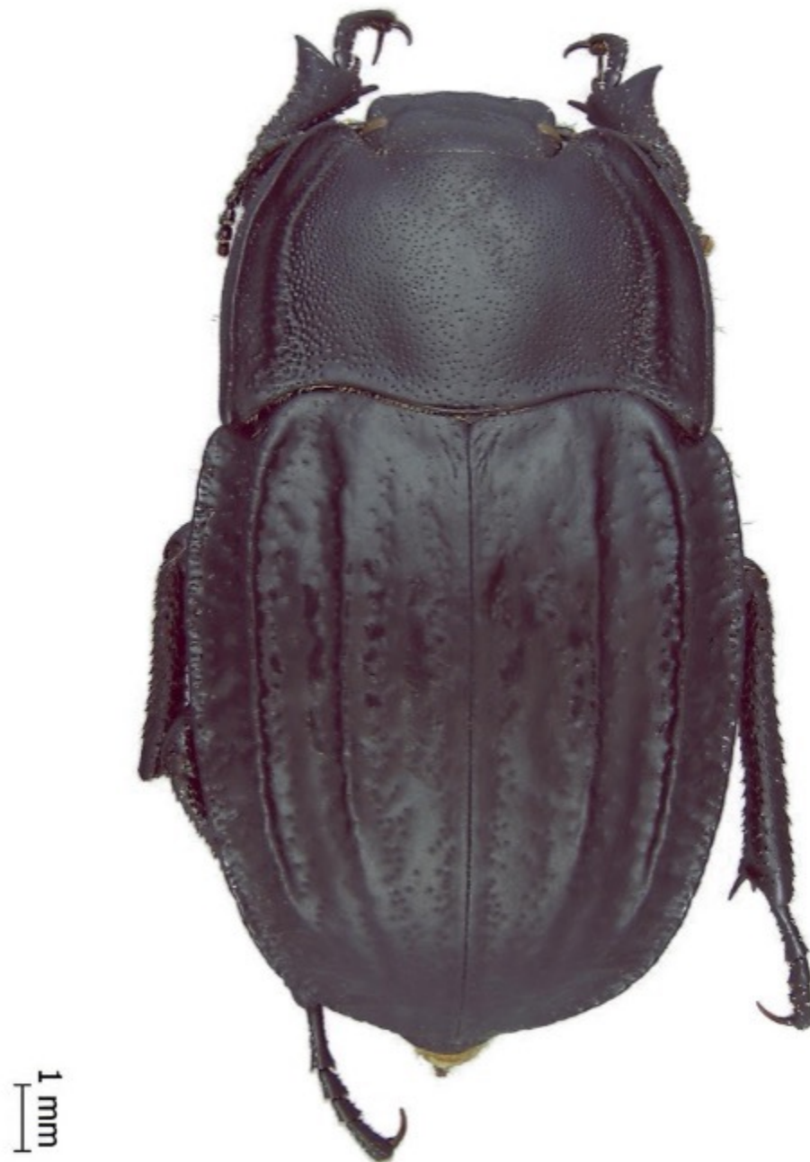
Fig. 1. Dorsal habitus of Praocis (Praonoda) crassicollis sp. nov., holotypus male.