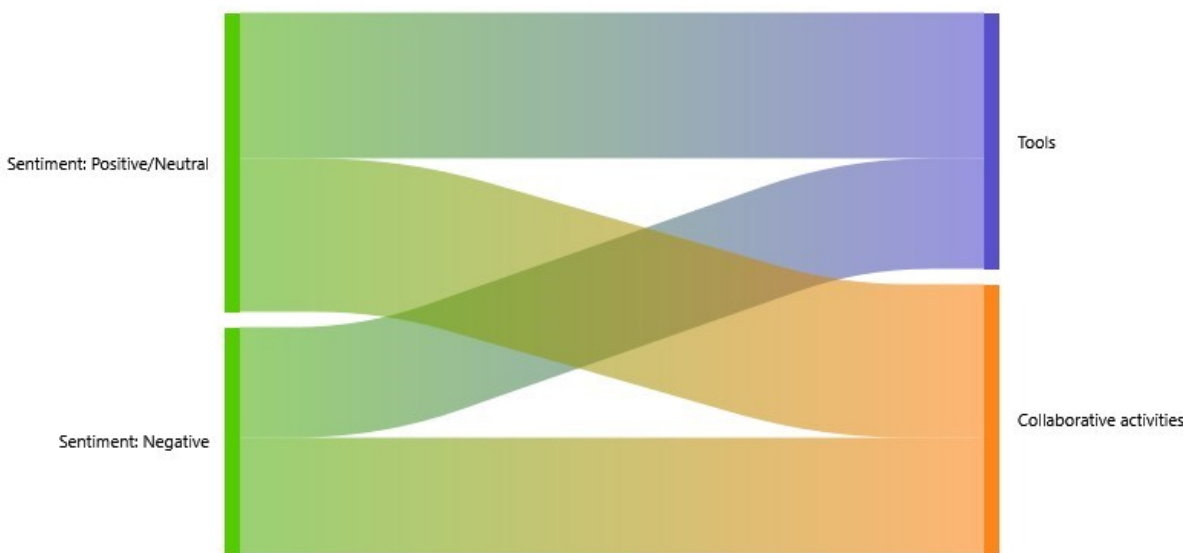
Figure 2 Sankey diagram of the relationship between core categories and student sentiment

Looking closer at the students' perceptions using the sentiment analysis provided by the analysis software, as shown in Figure 2, there was a higher positive/neutral sentiment towards both the tools and the collaborative activities. There was also an even distribution of sentiment between each of the categories. If filters were applied in the programme according to their grades (not reflected in figures or tables for the sake of image economy), the students with a pass grade had greater affinity for the tools, but not for the collaborative activities. In contrast, students awarded As and Bs expressed a more positive/neutral feeling for collaborative activities to the detriment of the tools.