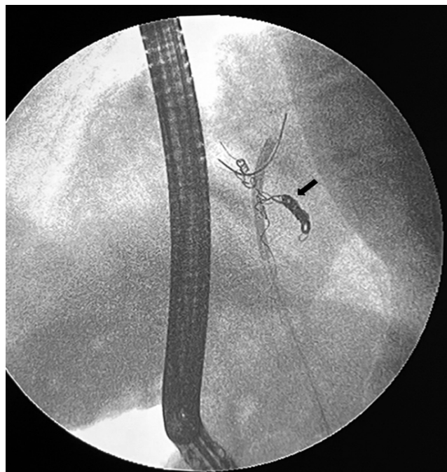
Figure 1. Fluoroscopic view, foreign bodies (coils) within the biliary tract (arrow).

This is a 54-year-old female patient who underwent laparoscopic cholecystectomy in 2022, resulting in bile duct injury and a biliary fistula. Postoperatively, she required ERCP and stent insertion, as well as management of haemobilia with hemodynamic repercussions secondary to a pseudoaneurysm of the right hepatic artery, which required emergency embolization with coils. She was admitted to the gastroenterology service for a scheduled ERCP and