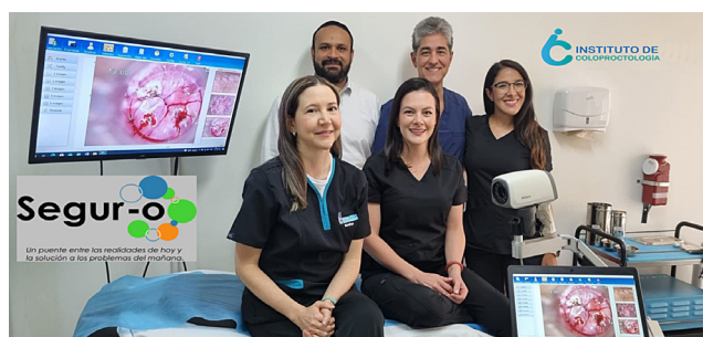
Figure 5. The human team of the Instituto de Coloproctología ICO specialized in high-resolution anoscopy.

To date, through ICO Seguro, we are the first program designed and implemented in Colombia that comprehensively guarantees the education of health personnel and patients and the detection, treatment, and monitoring of populations at risk of anal cancer ( Figure 5 ).