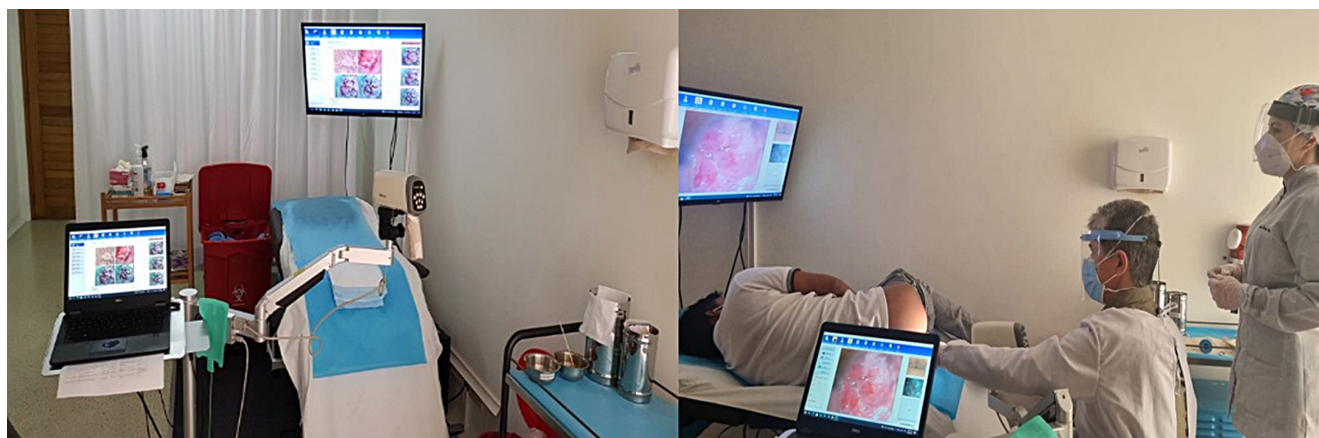
Figure 2. High-resolution anoscopy.

If abnormal cytology is detected on anal cytology examination, the next step in the management of AIN is HRA to attempt to localize the source of atypical cells. HRA involves examining the squamocolumnar junction, anal canal, and perianal skin under magnification using a colposcope. During anoscopy, a lidocaine-lubricated anoscope is inserted through the anus. Then a swab soaked in a 3–5% acetic acid solution is inserted into the anal canal while the anoscope is removed for one minute. Acetic acid causes an “acetowhite change” in areas of the abnormal transitional epithelium; the mucosa is carefully inspected for changes characteristic of AIN, including flat or slightly raised areas of thickened mucosa with or without abnormalities in the vascular pattern. Lugol's iodine is then applied similarly, but in this case, the lesions do not stain with iodine (negative for Lugol's stain) because iodine is glycophilic, and the dysplastic tissues lack glycogen and appear thick mustard in color. Any suspicious Lugol's iodine-negative lesion, including condylomas, atypical surface configurations, stippling, mosaicism, or atypical vessels, is biopsied under direct visualization ( Figures 2, 3, and 4 ).