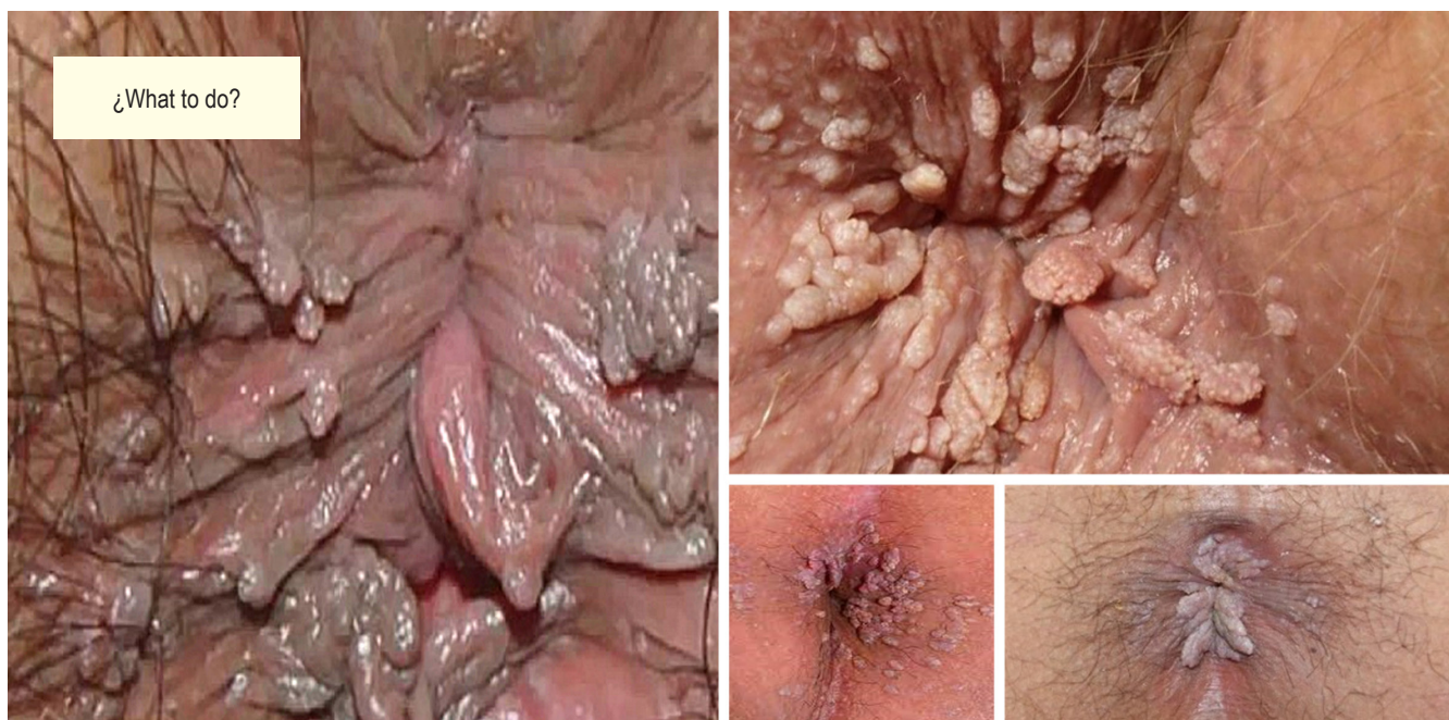
Figure 1. Anal and perianal condylomas.

Risk factors for HPV infection include sex with uncircumcised men, a partner who has had many sexual partners, and first sexual contact at an early age, as well as patients who have had a solid organ transplant (kidney, liver, among others), are undergoing chemotherapy or radiotherapy (leukemia, lymphomas), use biologicals, are chronic steroid users, have diabetes, among others, which conse-