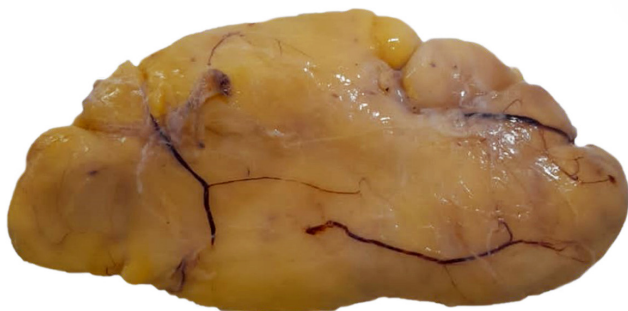
Figure 1. Lipoma expelled rectally with well-defined walls and no signs of bleeding.

A 42-year-old female patient with no significant pathological history consulted for a clinical condition of one year of evolution that had worsened in the previous 12 hours. It was characterized by non-radiating colic-type pain in the mesogastrium, without mitigating or aggravating factors, whose intensity was 5/10 on the visual analog scale. It was accompanied by the expulsion of a soft, non-fouling, yellowish mass through the rectum ( Figure 1 ).