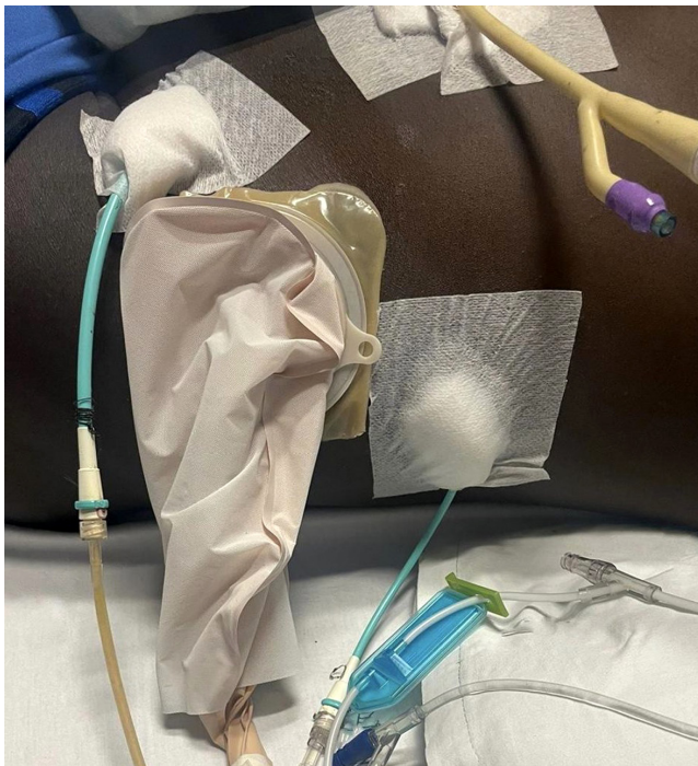
Figure 3. Two pig-tail drains in the left flank, a Foley catheter in the anterior abdominal region, and a working port for percutaneous endoscopic necrosectomy are visible.

Timely and effective drainage of infected necrotic tissue is essential for improving outcomes (5) . When there is clinical deterioration or a need for multiple interventions, a follow-up CT scan should be considered for further decision-making (4) . In the presented case, multiple ineffective interventions, undrained collections, and exposure to various antibiotic regimens led to the development of multidrug-resistant bacterial strains, underscoring the importance of effective drainage.