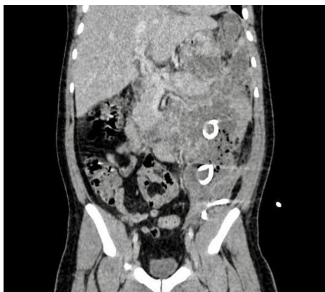
Figure 1. Contrast-enhanced abdominal CT scan. Coronal section. Percutaneous drains are visible.

A new abdominal CT scan ( Figure 1 ) showed pancreatic necrotic collections dependent on the tail, with central and left-sided abdominopelvic distribution, and these collections were in contact with the gastric wall.