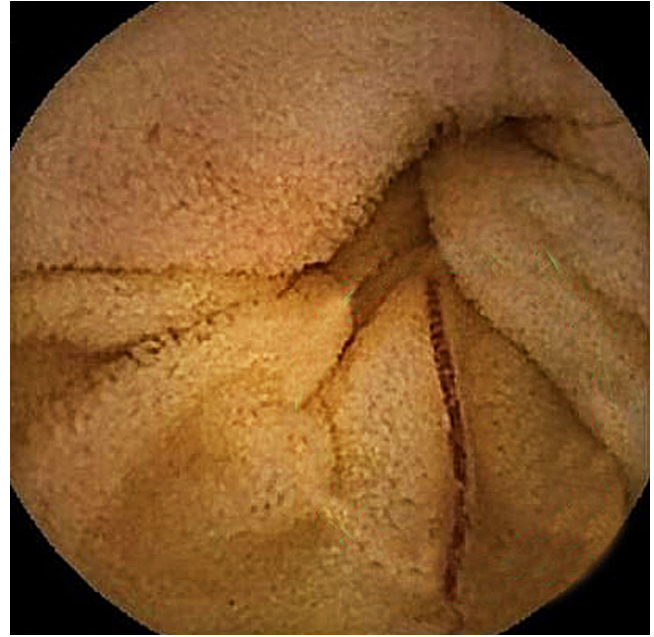
Figure 2. Capsule endoscopy identified hookworms in the patient's small intestine.