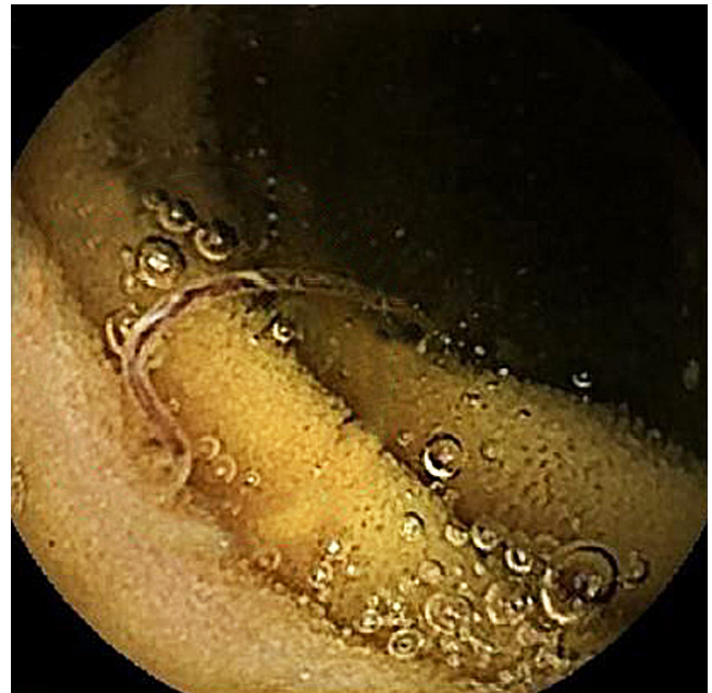
Figure 4. Hookworm in the mucosa of the patient's small intestine.

ily Ancylostomatidae , with the most representative species being A. duodenale , N. americanus , Ancylostoma caninum , and Ancylostoma braziliense . All of these species can cause disease in humans; however, A. caninum and A. braziliense also affect dogs and cats, respectively, and represent zoonotic infections