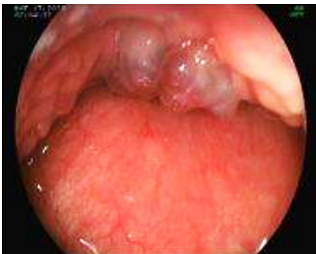
Figure 2. BRBNS at the base of the tongue.

BRBNS is classified into three types: type 1 presents as a large, deforming cavernous angioma that may obstruct vital tissue; type 2, the most common, appears as a “blue rub-