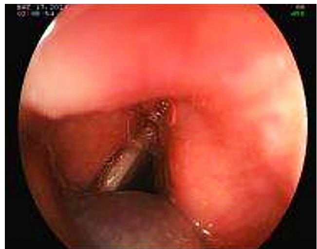
Figure 3. BRBNS in the supraglottic region.