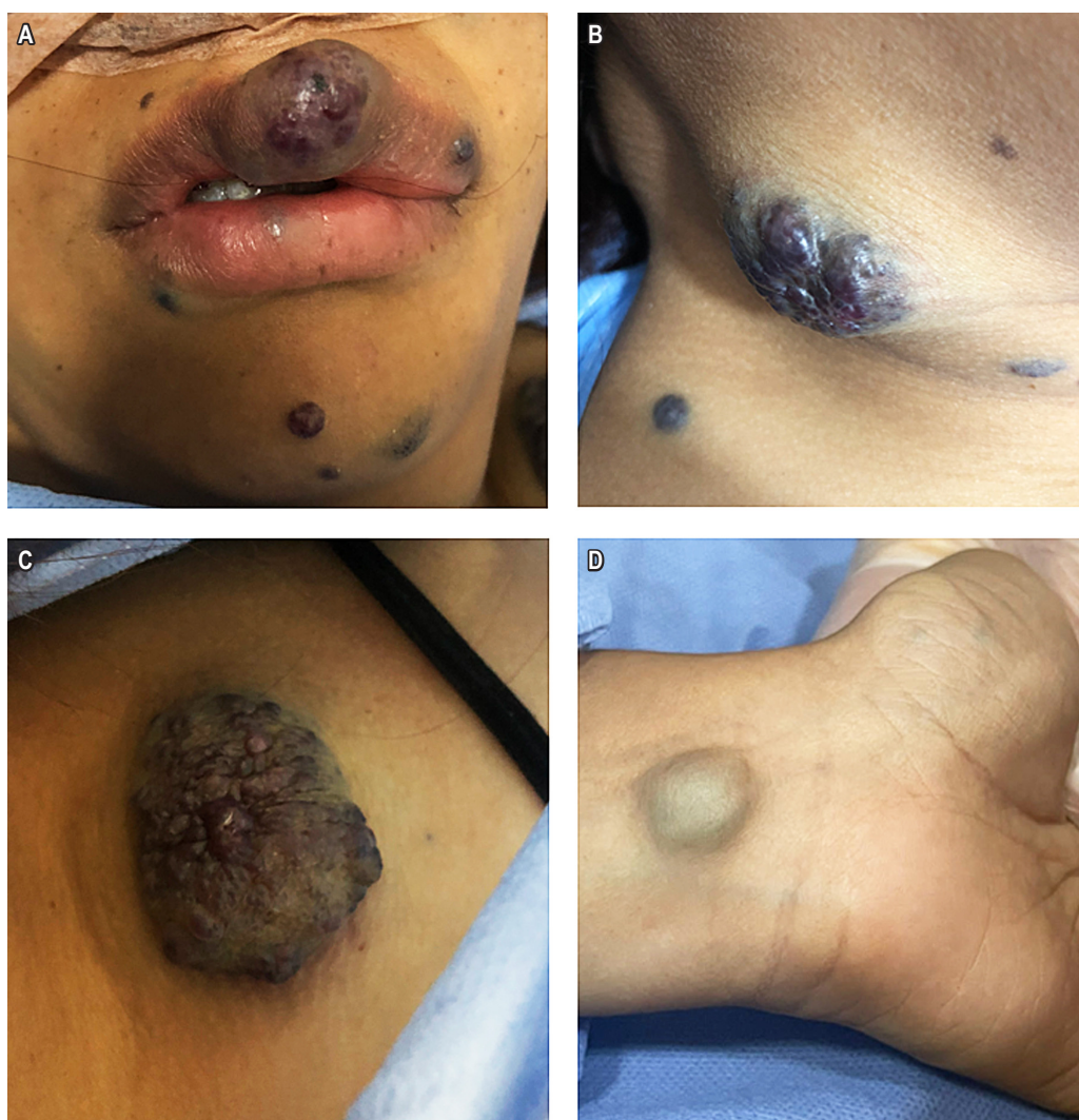
Figure 1. BRBNS in the lip and skin. A. Upper lip and facial area. B. Neck. C. Chest. D. Wrist.

Blue rubber bleb nevus syndrome (BRBNS) was first described by Gascoyen in 1860. However, William Bennett Bean later named the disease in 1958, and it is thus also referred to as Bean syndrome . BRBNS is an extremely rare and potentially hereditary condition, with an estimated incidence of 1 in 14,000 live births and only about 200 cases reported globally (2,4-6) . This syndrome is characterized by numerous hemangiomatous, violaceous, raised, and elastic lesions, primarily affecting the skin and digestive system.