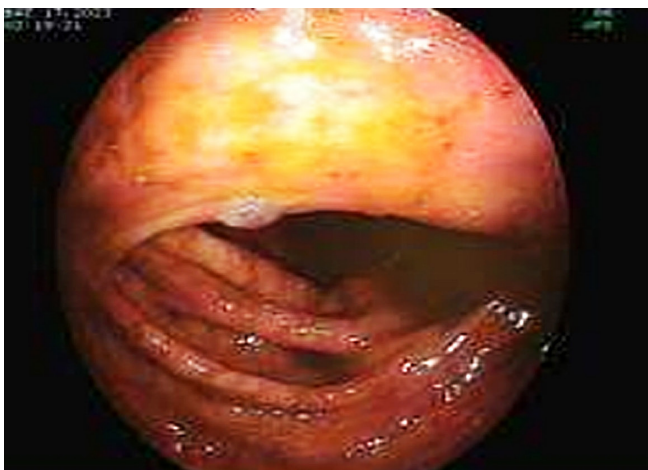
Figure 4. BRBNS in the cecum.