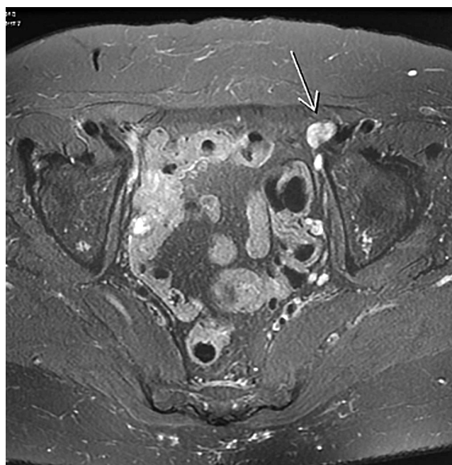
Figure 1. Initial magnetic resonance imaging showing lesions consistent with anal cancer in a locally advanced stage.

ment. A follow-up pelvic magnetic resonance imaging was performed four months after treatment cessation, which reported persistent irregular thickening of the anal canal walls on the left side, between the 12 o'clock and 6 o'clock positions, with involvement of the internal sphincter, intersphincteric space, external sphincter, and dentate line measuring approximately 35 mm (compared to 40 mm in the previous study), with involvement of the perianal fat and the posterior wall of the adjacent vagina. Compared to the prior study, these findings showed a moderate decrease in the vascularization pattern, with no evidence of lymph nodes or adenopathy in the left inguinal region.