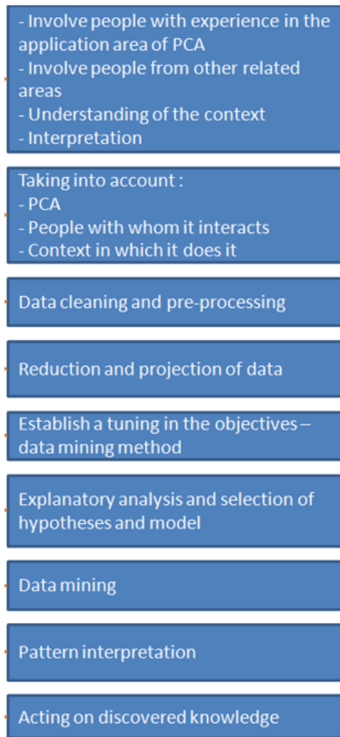
FIG. 2. KDDIAE