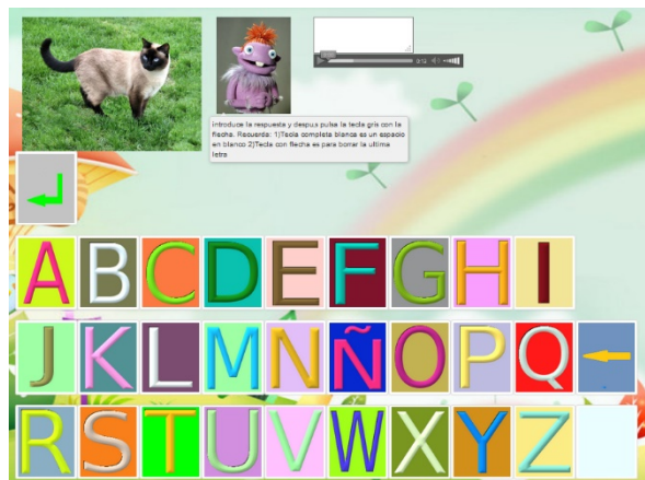
FIG. 1. Sample snapshot of Dr. Roland Source: [18].

In a previous study [18], we proved the benefits of using PCAs for education. However, methodologies for the design, integration, and evaluation of agents in the classroom are not found in the state of the art. For that reason, we proposed a methodology called MEDIE (stands for Methodology to Design) to design PCAs [18]. MEDIE was used to create the agent named Dr. Roland [18], which was the first agent to be used in Pre-Primary Education (see Fig. 1).