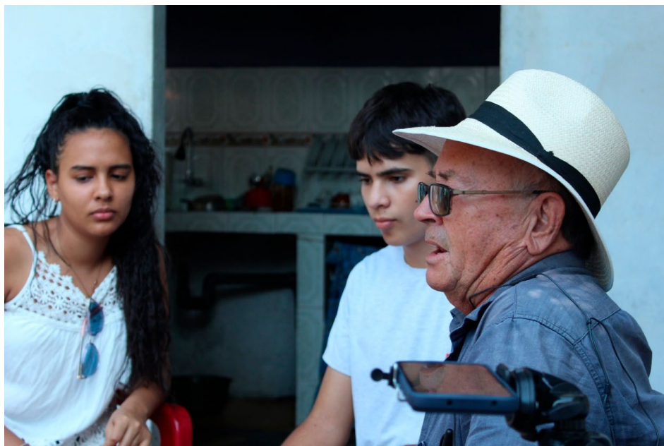
Figure 2. Production Podcast on the foundation of San Diego.