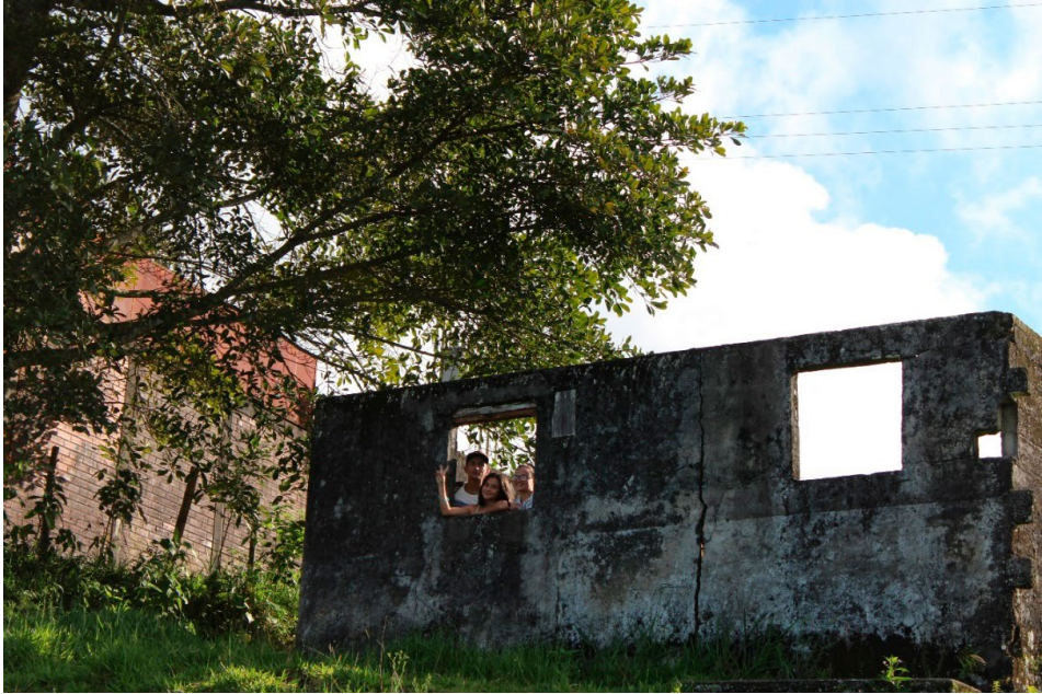
Figure 3. Old Military Base, Village of Venecia.

Source: Photography taken by Moreno in September 2021.