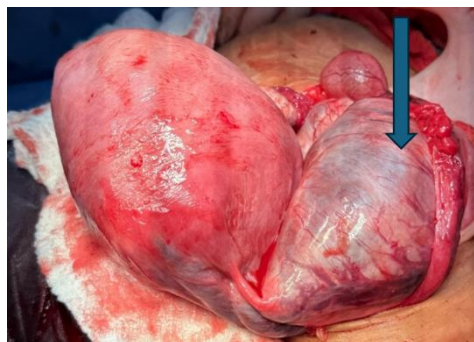
A post-pregnant uterus was visualized in a transsurgical cesarean section with partial exposure of the highly vascularized left ovarian tumor

Surgical findings. Abundant adipose tissue approximately 10 cm, posterior fundic placenta, gestational age pregnant uterus, left ovarian cyst measuring approximately 22 x 17 cm in diameter. Bleeding muscle plane clear amniotic fluid moderate amount, live newborn Apgar 6-7-7 weight 3695 g, head circumference 35 cm, height 47 cm, thoracic circumference 31 cm, abdominal circumference 30 cm, Capurro 36 weeks gestation. Right appendix macroscopically normal, blood loss of about 500 mL, complete materials, trans-surgical diuresis 200 mL.