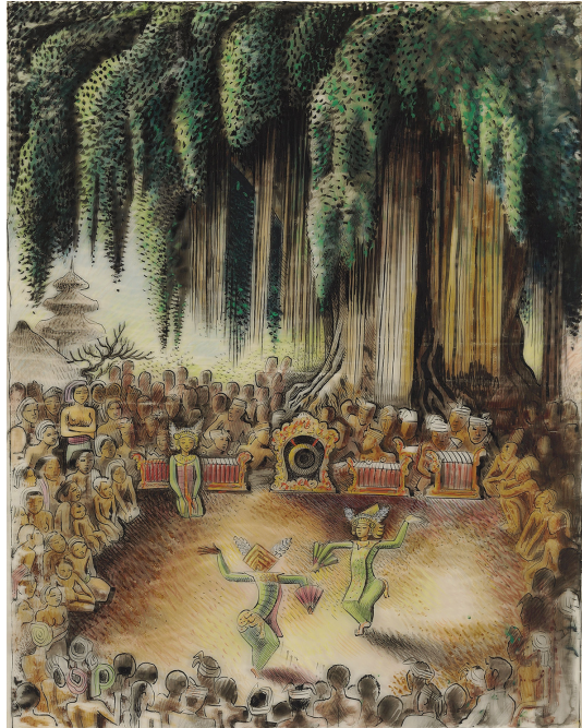
2. Miguel Covarrubias, Legong Performance under a Banyan Tree , gouache on paper, 48.2 × 38.1 cm, Museum Pasifika, Bali.

undesirable influences from them, and helping them to sell their work in the museum of Den Pasar, a clearing-house where only pictures of high quality are exhibited. 9