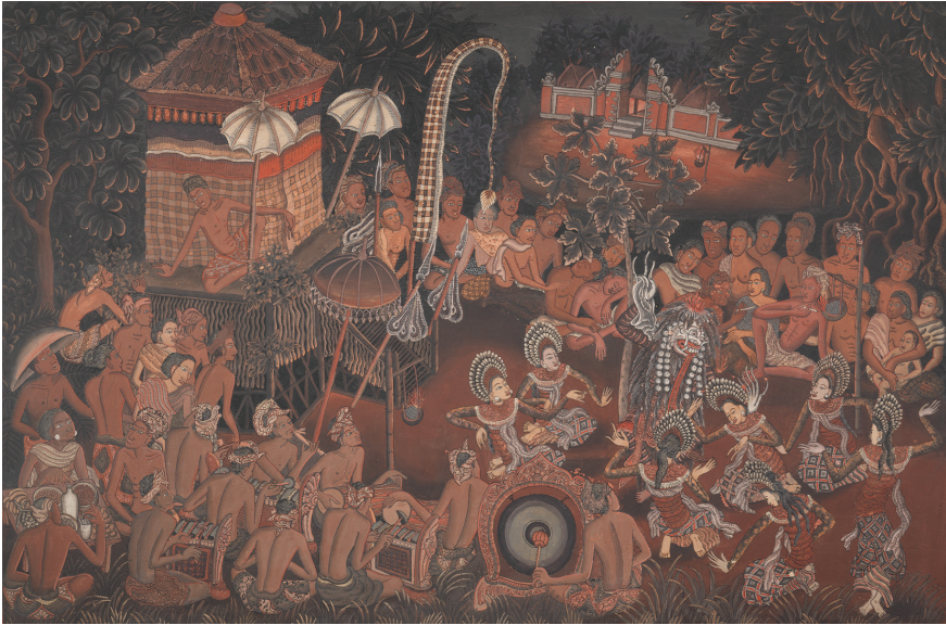
3. I Dewa Gede Sobrat (b. 1912 or 1917 - d. 1992), Calon Arang , c. 1937, ink and paint on wood, 65.1 × 95.9 cm, Fowler Museum at UCLA; X74.L375, Anonymous donor.

image by the same artist, and later there is a depiction of a shadow play performance by Ida Bagus Made Nadera. 14 Some of Covarrubias's other illustrations were copies of drawings from Balinese paintings or palm-leaf manuscripts, including the offending naked woman mentioned by Pollmann. 15