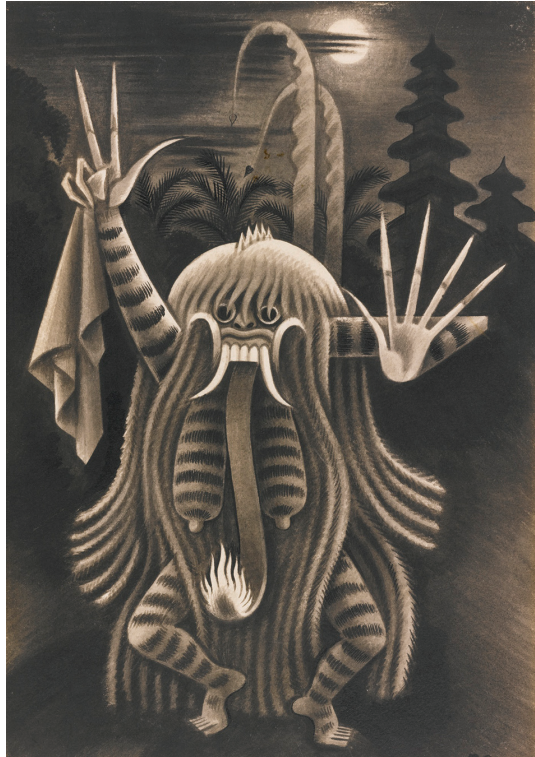
5. Miguel Covarrubias, Rangda , 1937, graphite, charcoal and ink on paper, 38 × 25 cm, Museum Pasifika, Bali.

interest and should have a quite large and continuous sale.” This prediction was very accurate.