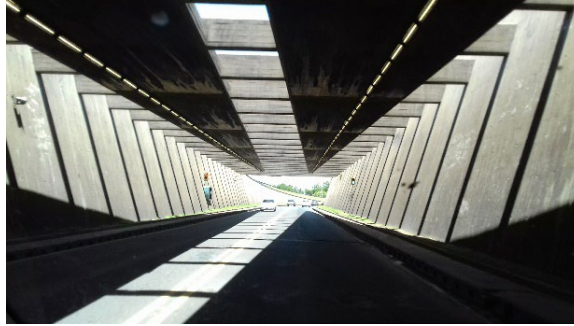
Figure 5. Combination of Lights and Shadows Inside the Subfluvial Tunnel