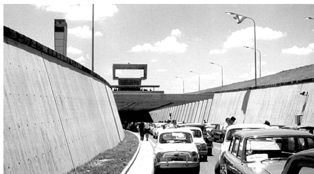
Figure 4. Inauguration Day. Subfluvial Tunnel