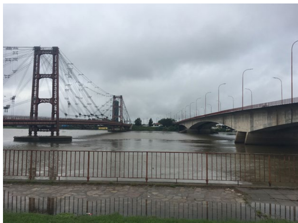
Figure 8. View of the Oroño Bridge (right) and the “Colgante” Bridge Reconstructed in 2002 (left).