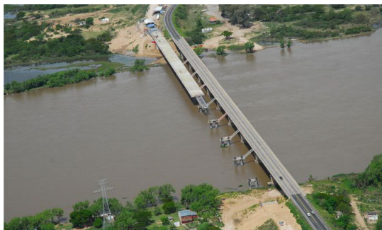
Figure 3. Aerial View of the Original Bridge over the Colastiné River and Construction of the Second Bridge Using the Launching System