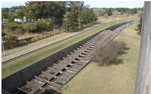
Figure 6. Incoming Beams on the Parana Side as Seen from the Chimneys