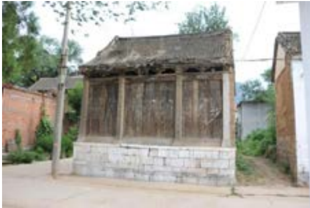
Figure 2 - Ancient Theater of Official House in Yanghe Village, Wulong Town

Photographed by the author Hengli Peng, on July 22, 2019