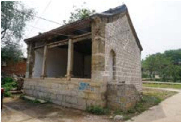
Figure 4 -Ancient theater of official house in Lingxi Village, Shayao Town

Photographed by the author Hengli Peng on August 12, 2019