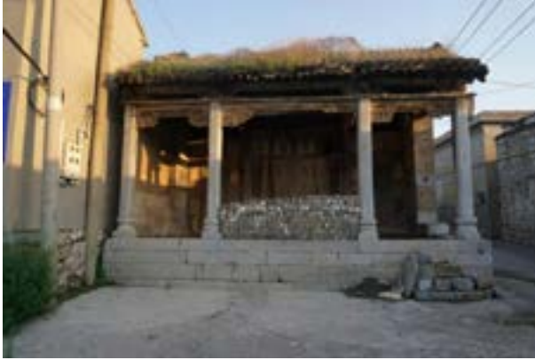
Figure 1 - Ancient Theater of Official House in Jiaoling Village, Tongye Town

Photographed by the author Hengli Peng, on August 15, 2019.