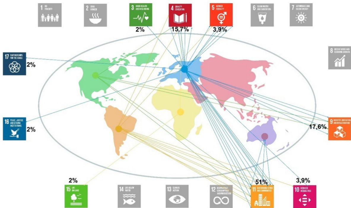
Figure 2 – SDGs covered by continent (2022/23)