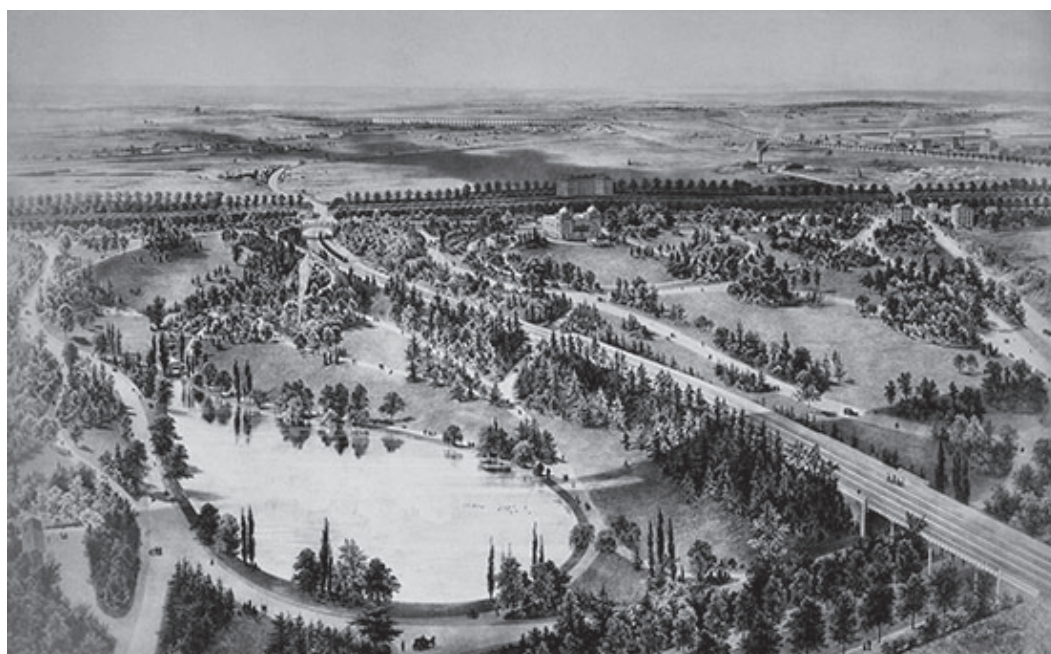
Figure 3: Parc Montsouris, around 1853-1870