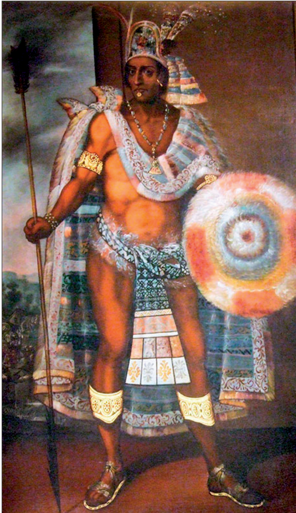
Figure 7. Attributed to Antonio Rodríguez, 'Moctezuma II', 1680-97. Oil on canvas. Florence.

Thanks to this evidence, we can understand how Sigüenza y Góngora put his ethnographic sources in service of a rhetorical project to magnify the viceroy and simultaneously promote his own nationalistic agenda. If we ask, 'what makes