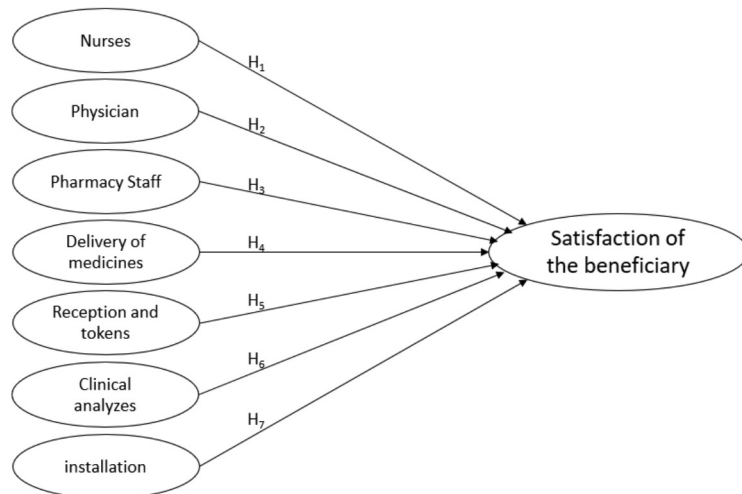
Figure 1. Approach and hypothesis

Although these types of studies typically present satisfaction as a mediating factor between service quality and customer loyalty, in this case the relationship is only posed between service quality (as independent variables) and satisfaction as a final dependent variable. This is due to the fact that in the health sector institutions of the State, the beneficiary has little opportunity to choose the institution that will meet his health needs. In Mexico, a state worker is obligatorily registered in the ISSSTE, while a private sector worker is registered in the IMSS. Hence, those citizens who do not have access to social security are left with the SSa or the Seguro Popular as their only state-provided options. Therefore, we did not implement any variables related to the preferences and intentions of the beneficiary. However, although the beneficiary has limited choices, the position here is that it should be the obligation of the state, and of these institutions, to provide the best possible service to the affiliates.