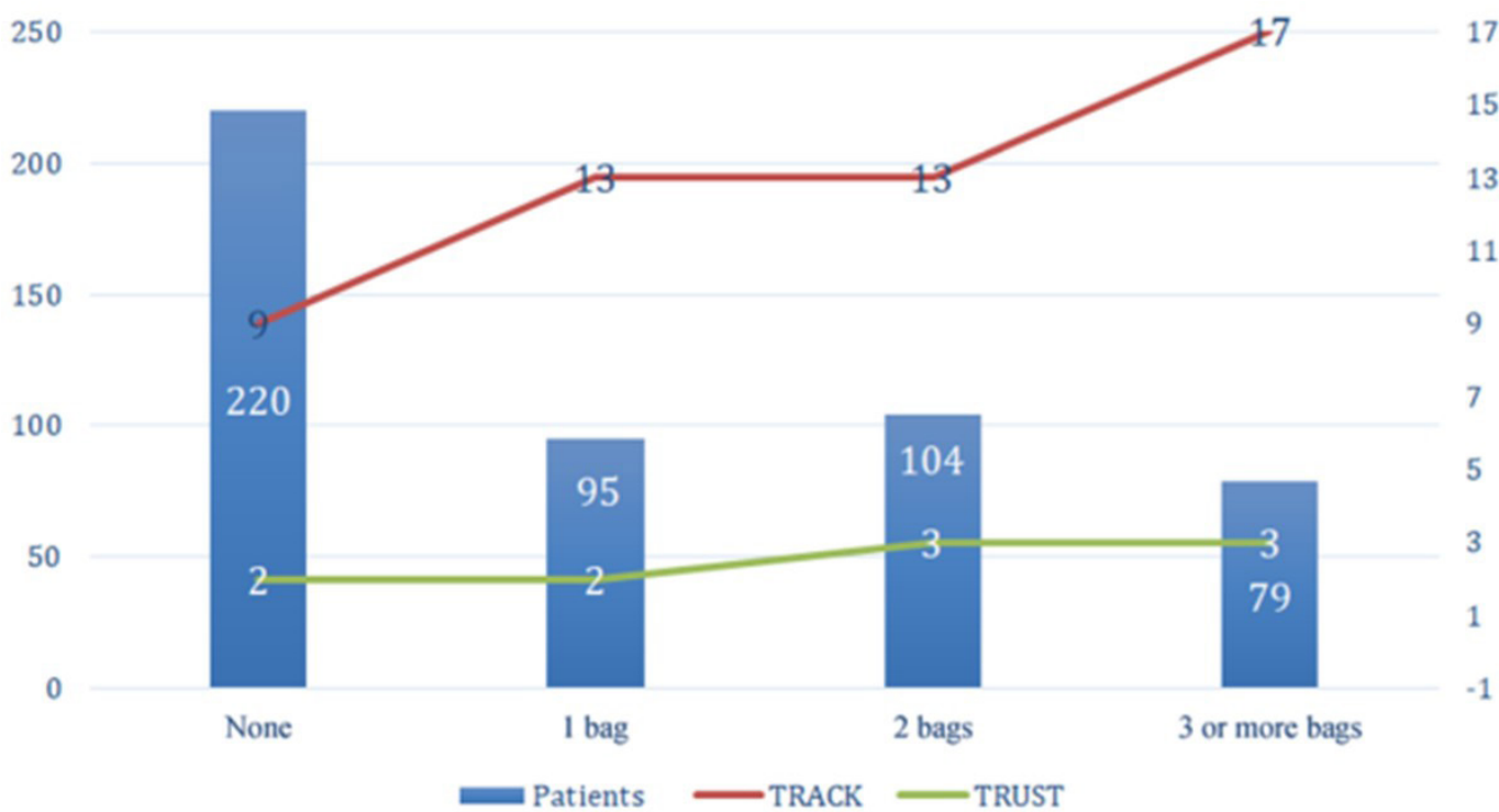
Fig. 2 - Transfusion Risk Understanding Scoring Tool (TRUST) and Transfusion Risk and Clinical Knowledge (TRACK) scores compared with number of blood bags. Kruskal-Wallis test, P -value < 0.001.