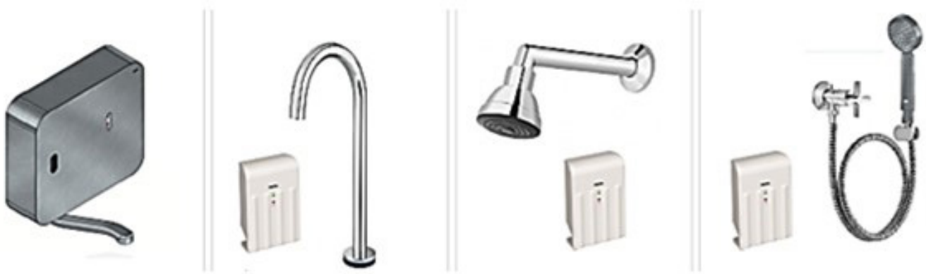
Fig. 1 - Faucets, shower, and hygienic shower models installed with ozonized water system.