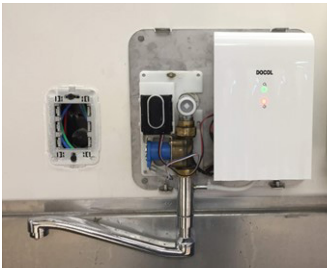
Fig. 2 - Internal view of ozonized water system faucet.

Nominal qualitative variables were compared using the chi-square test or Fisher's test. For comparison of quantitative variables with Gaussian distribution, the nonparametric t -test was used. For comparison of discrete quantitative variables or of continuous quantitative variables without Gaussian distribution, the Mann-Whitney U test was used.