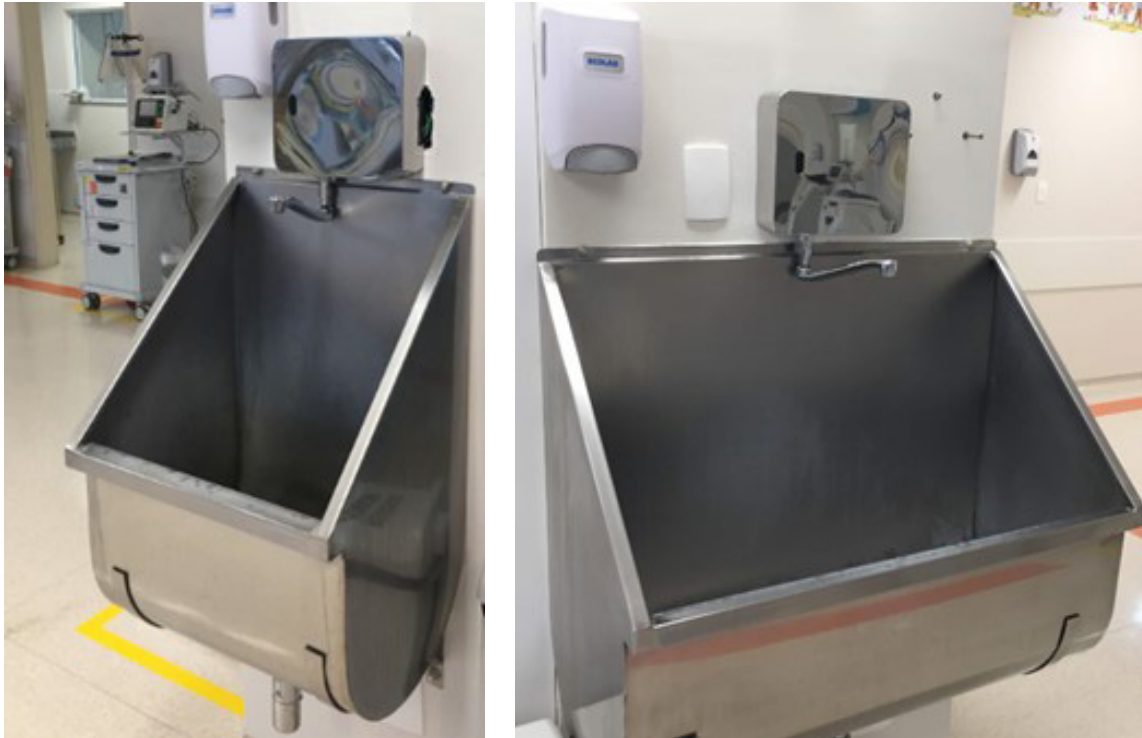
Fig. 3 - External view of ozonized water system faucet.